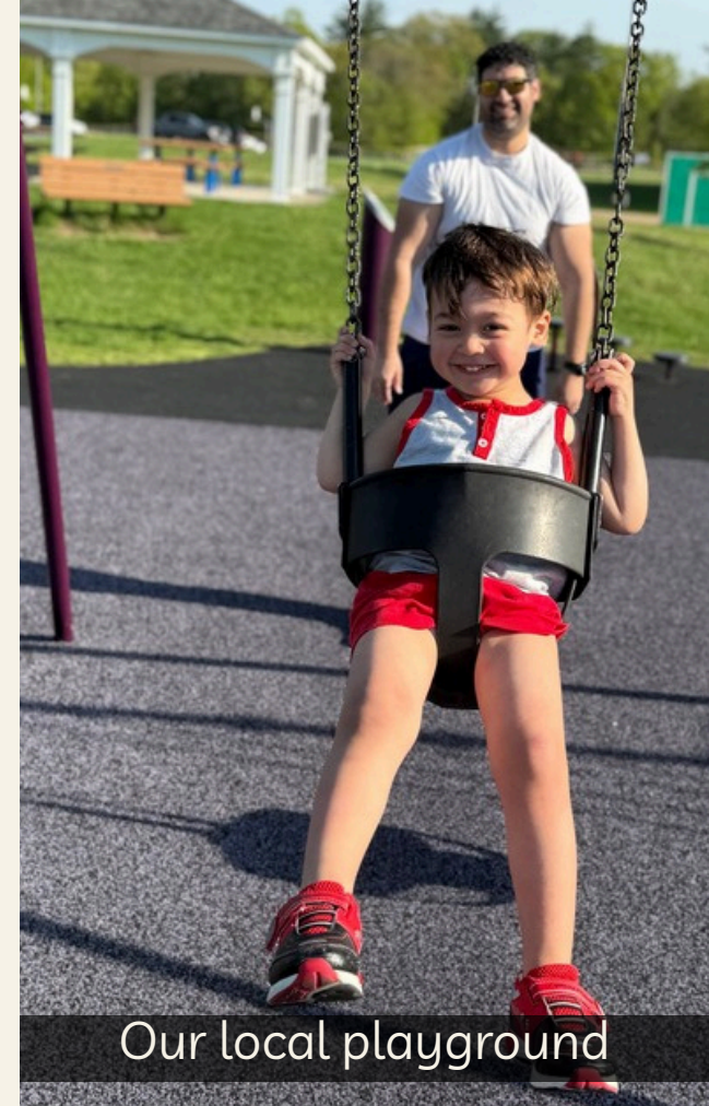
Our local playground

The boys love going to the library and the playground that is right by our house. We frequently visit local museums, parks, farmer's markets, zoos and local festivals with friends and family.