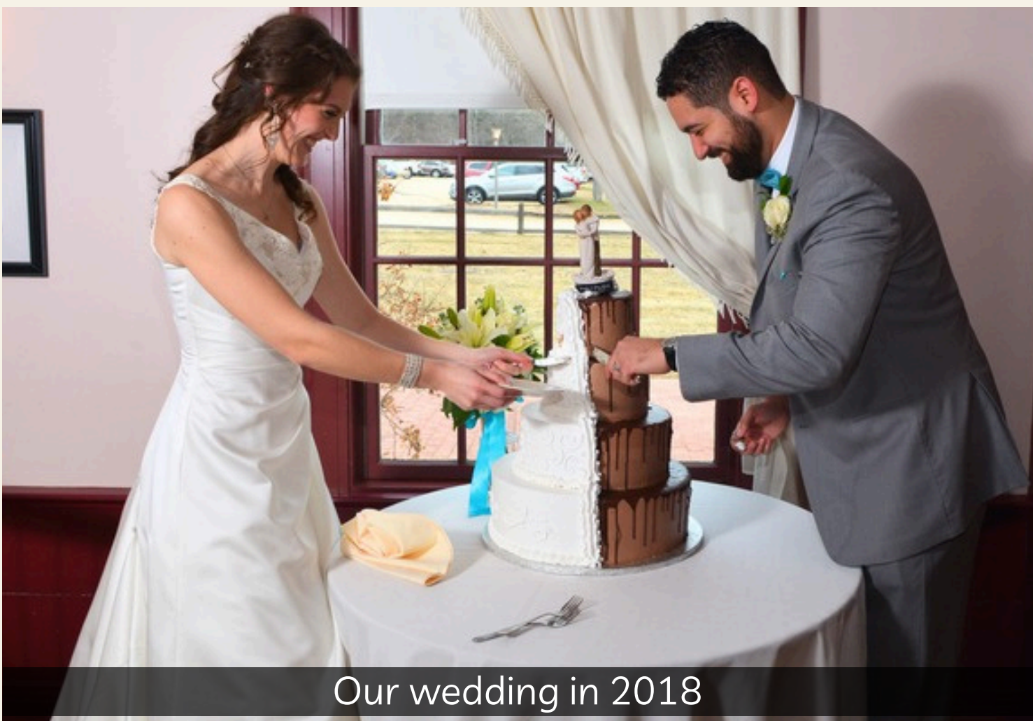
Our wedding in 2018