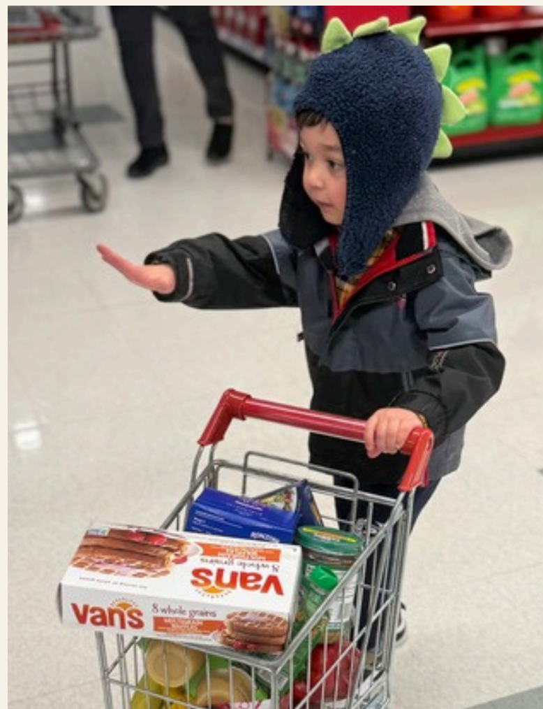
He's got his own cart we bring into stores

We never skimp on affection in this family. We're quick to celebrate and remind them how much we love, cherish and enjoy them. There is an abundance of giggles, hugs and kisses in our home, and there always will be.