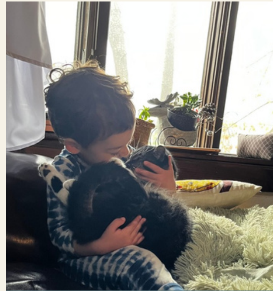
Kids, plants, and kitty cats alike love our large bay window. Our cat Nena is cuddly and sweet, and oh so patient with the boys.