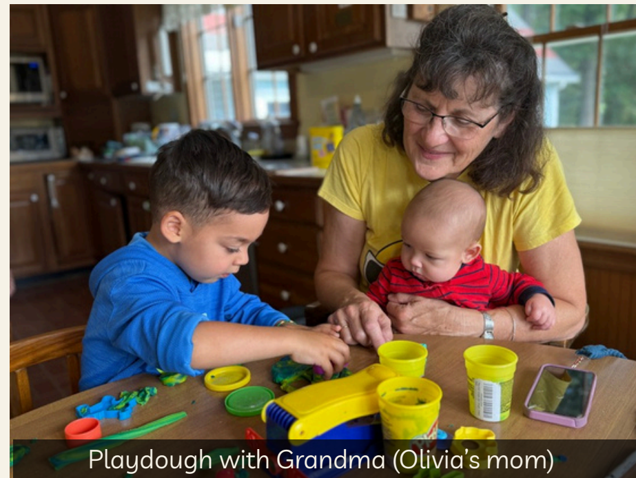
Playdough with Grandma (Olivia’s mom)