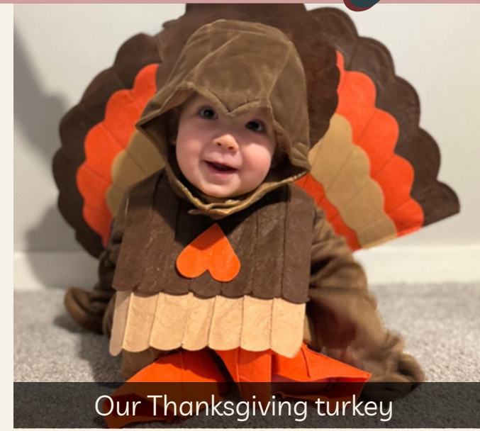
Our Thanksgiving turkey