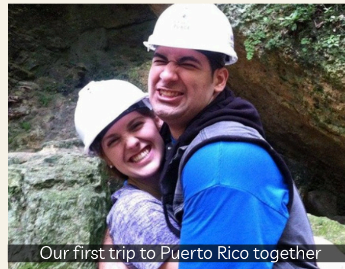
Our first trip to Puerto Rico together