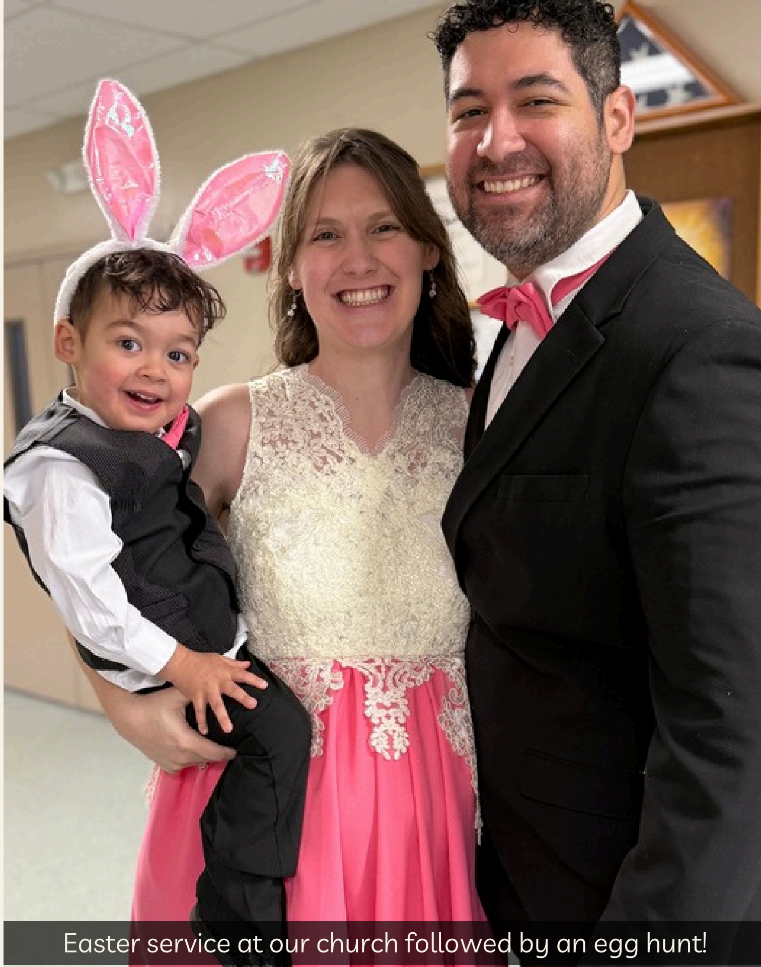
Easter service at our church followed by an egg hunt!