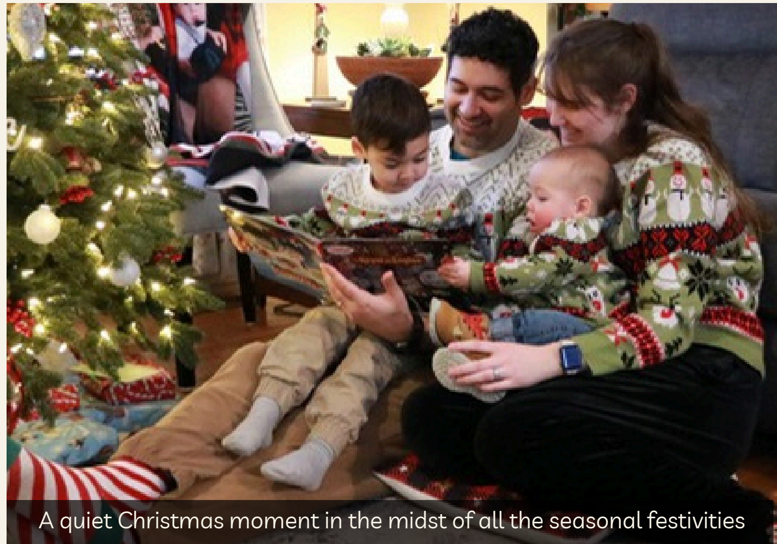
A quiet Christmas moment in the midst of all the seasonal festivities