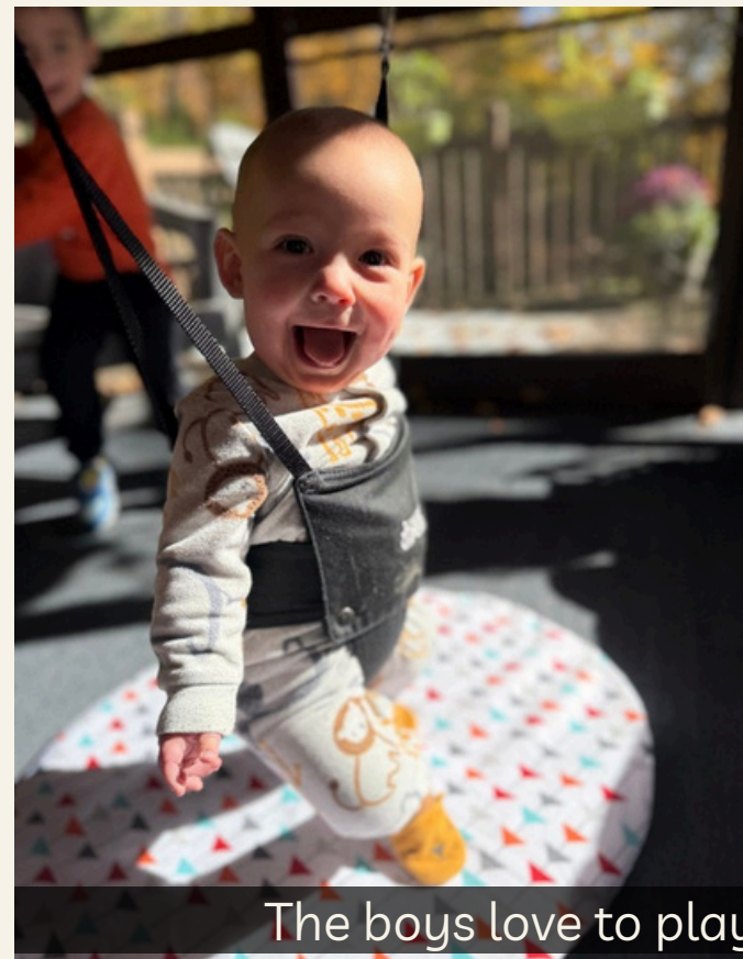
The boys love to play in the yard and on our porch!