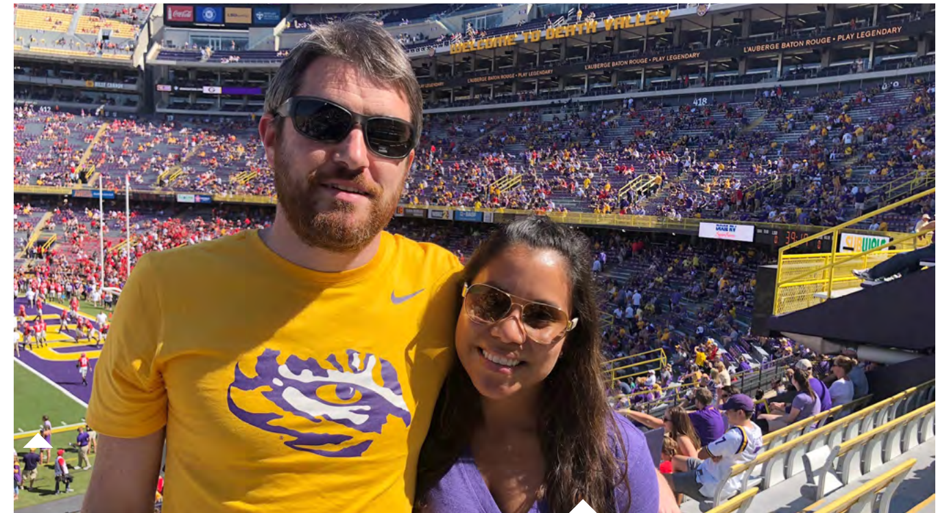
OUR FIRST LSU GAME TOGETHER IN LOUISIANA