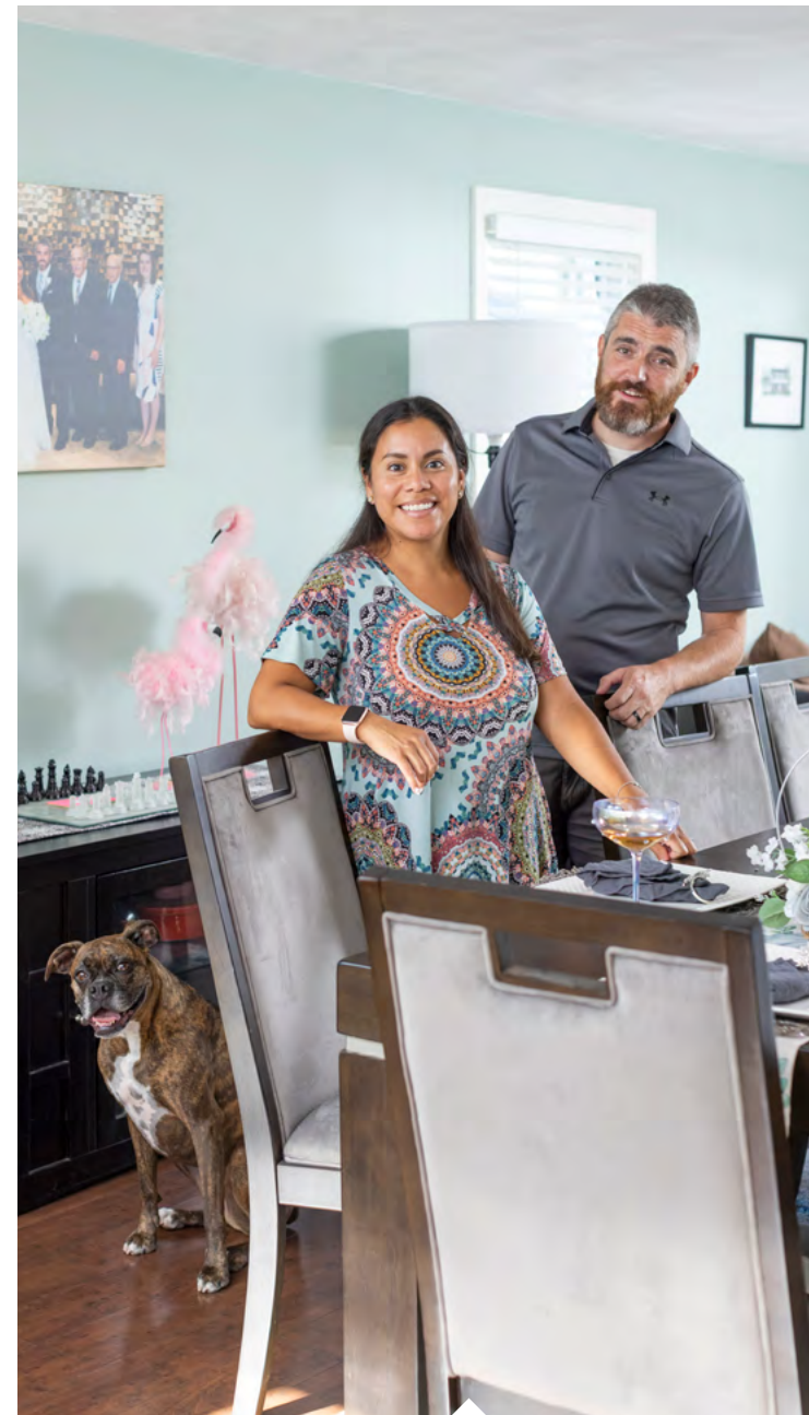
PREPARING FOR FAMILY DINNER