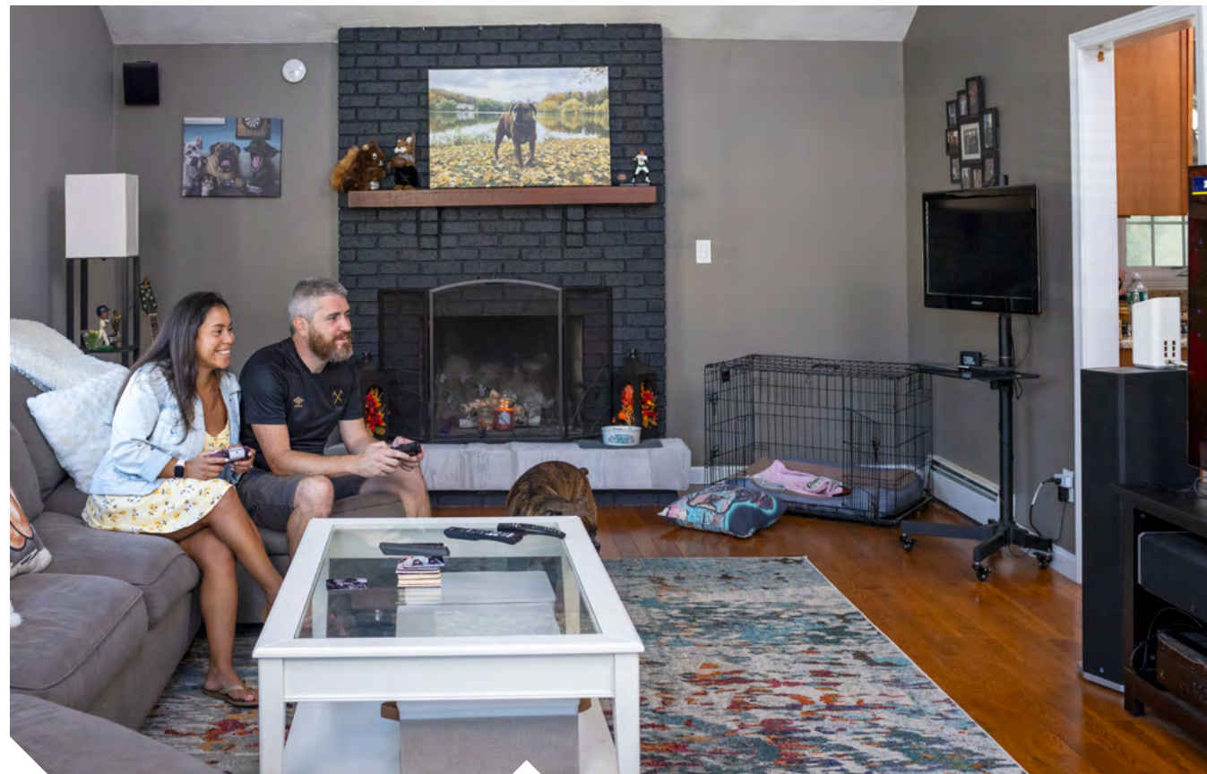
GAME TIME IN THE LIVING ROOM IS OUR FAVORITE WAY TO UNWIND