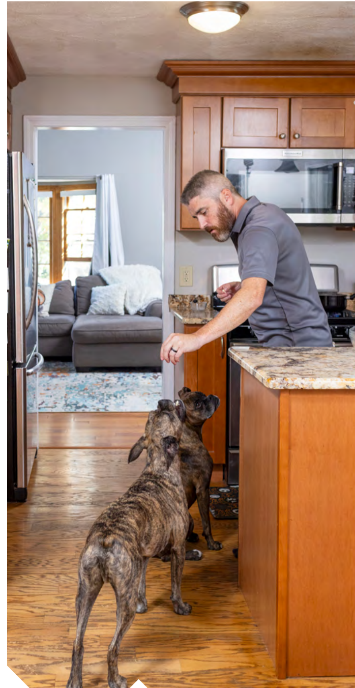
THE DOGS ARE HOPEFUL TASTE-TESTERS