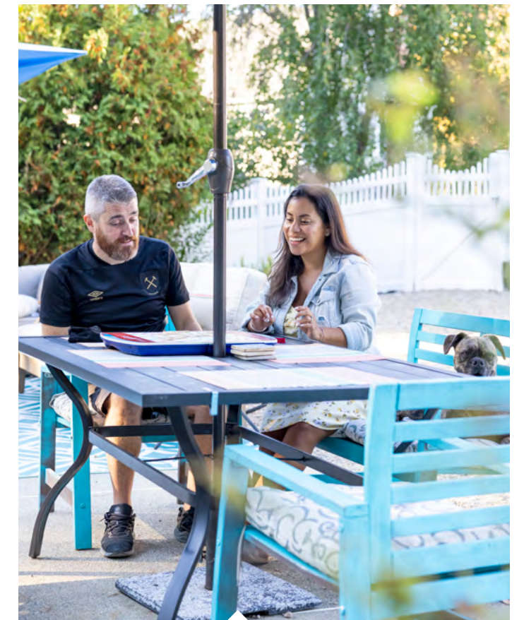
OUR KIND OF POOL DAY: SUNSHINE, SNACKS, PUZZLES, AND SCRABBLE

Less than a mile down the road are the town playground and community fields, which are constantly filled with local sporting events. The community hosts events at this location, such as the July 4th fireworks we attend annually. We love how close we are to everything—a quick 15-minute drive to our favorite breakfast spot, 20 minutes to the zoo, and 30 minutes to our state capital.