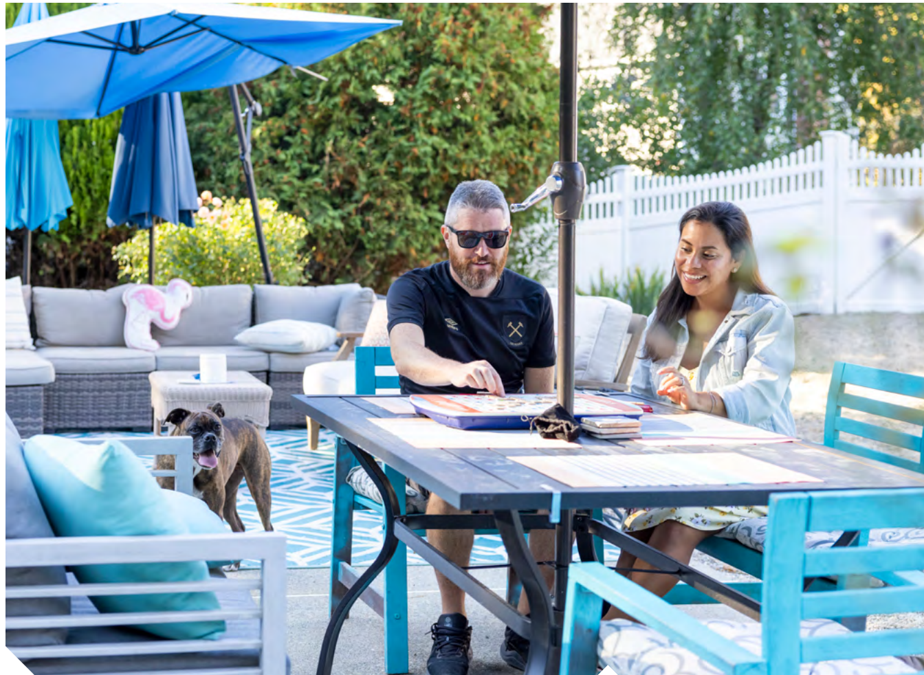
WE LOVE PLAYING SCRABBLE BY THE POOL

Just three months later, we became an official couple. Two months after that, we exchanged “I love you,” and within a year, we moved in together. Four years later—on the exact anniversary of our first date—we were married in June 2022, surrounded by family, friends, and our two mini boxers.