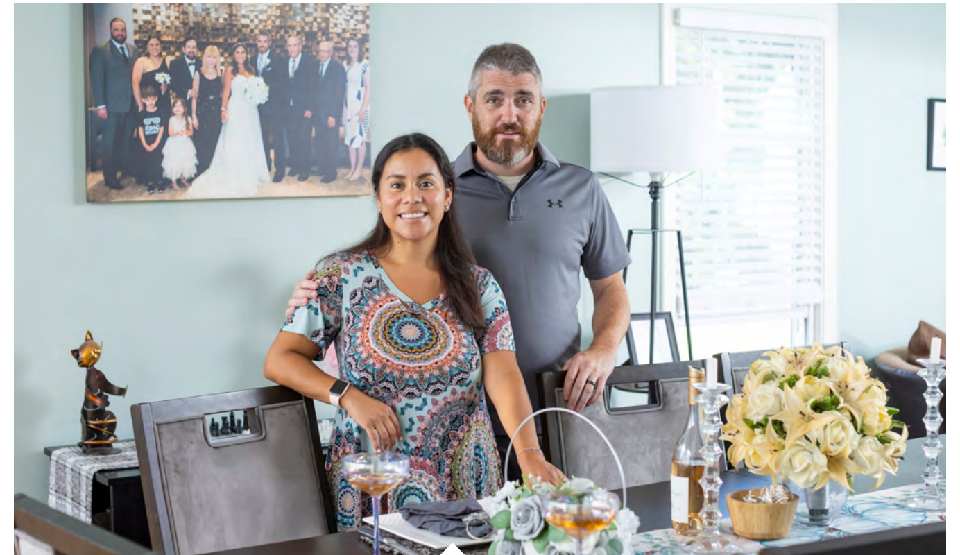
WE ENJOY HOSTING OUR FRIENDS AND FAMILY FOR ALL EVENTS

We often end summer nights around the fire pit, roasting s'mores and drinking hot chocolate. When the weather cools, you'll find us cozied up in the living room, watching sports or playing video games, while Finn and Fury keep a close eye on the neighborhood.