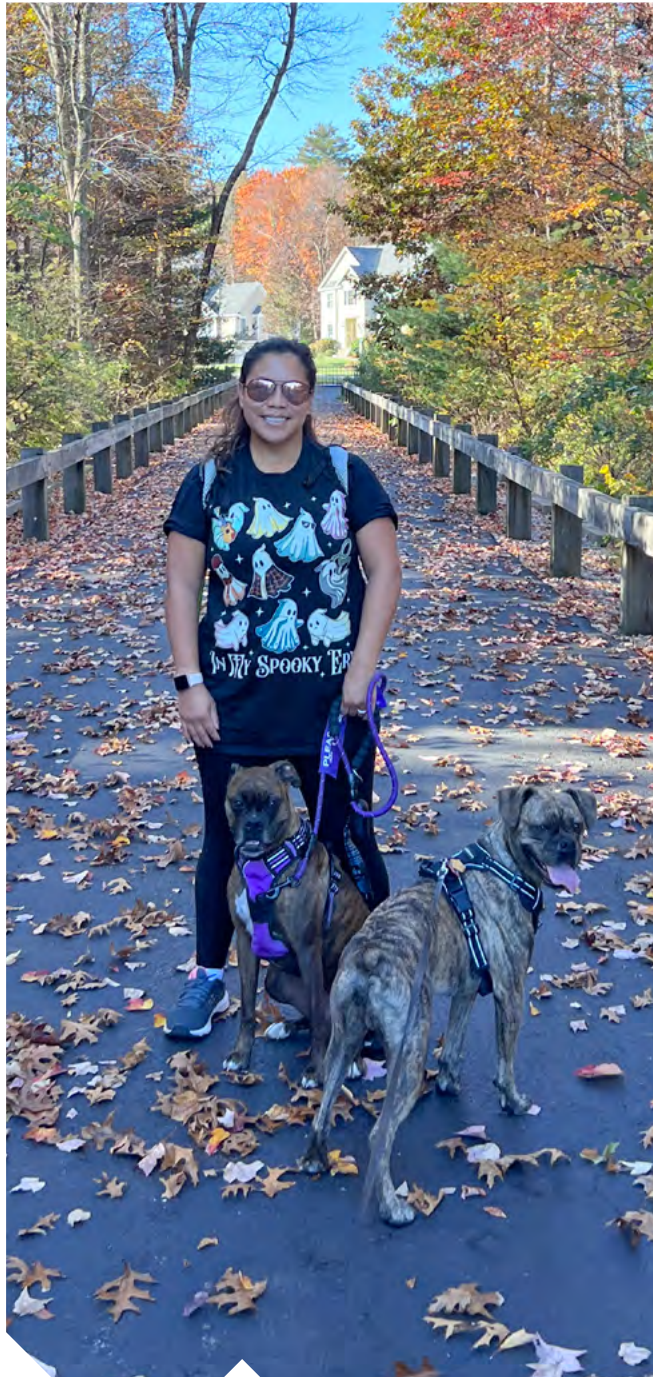
ONE OF OUR FAVORITE ROUTINES IS TAKING LONG WALKS WITH THE DOGS.