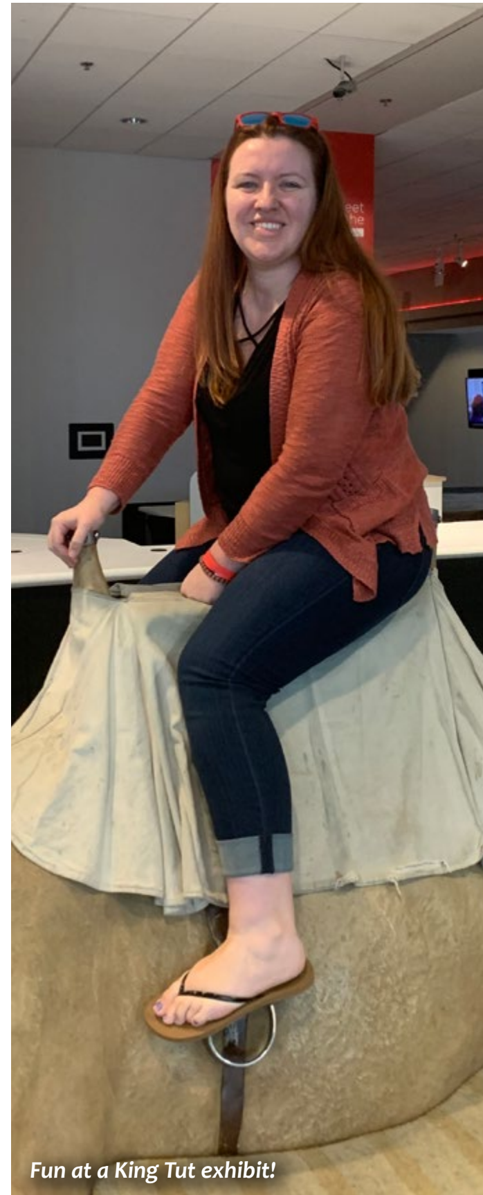
Fun at a King Tut exhibit!