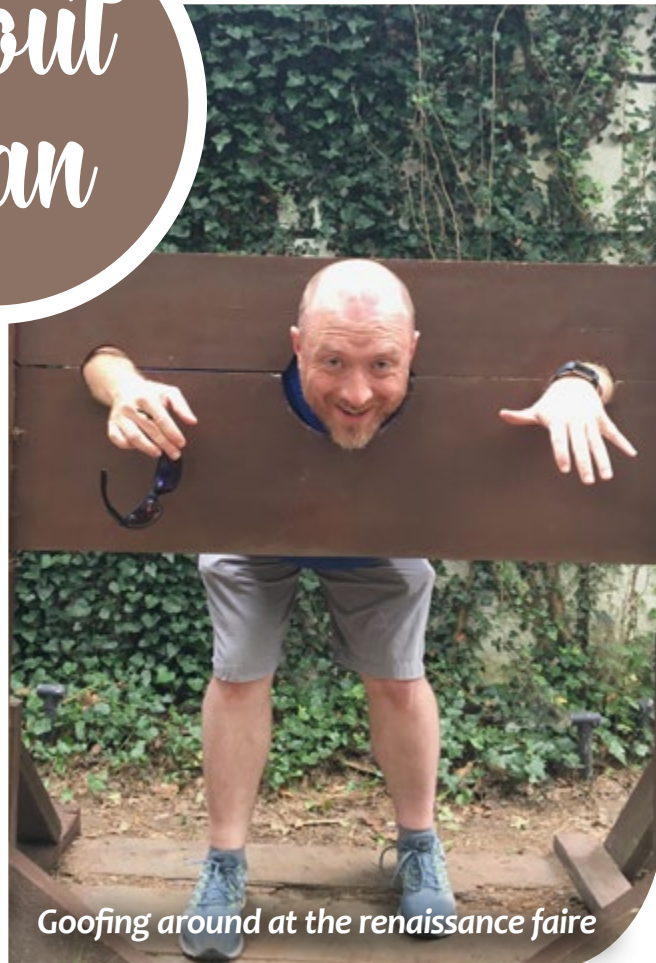
Goofing around at the renaissance faire

Some of the formative experiences of my life have taken place while traveling, whether as a child or an adult. My mom is from Michigan and my dad was born in Ireland, and visiting family exposed me to new traditions, neighborhoods, and lands. When I went to Ireland for the first time, I understood a lot more about my dad than I had before. I also felt at home, even though I was far away from the city where I lived much of my life.