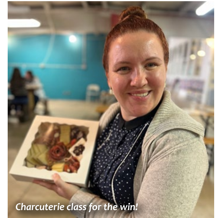
Charcuterie class for the win!

When I was a teacher, I loved being with the students and sharing my love of history. While middle schoolers can have a tough reputation, I loved being with them, even when they were their most teenage selves. After some time in the classroom, I decided to go back to my lifelong love of books and get a degree in School Librarianship. This new training led to a job as a digital learning specialist in my district – school librarians need to know a lot of tech! I work with teachers and with students of all ages, from kindergarten to high school. Since my mother was adopted, I have always thought of adoption as a positive option when the time came to have a family.