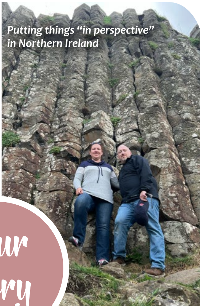
Putting things "in perspective" in Northern Ireland