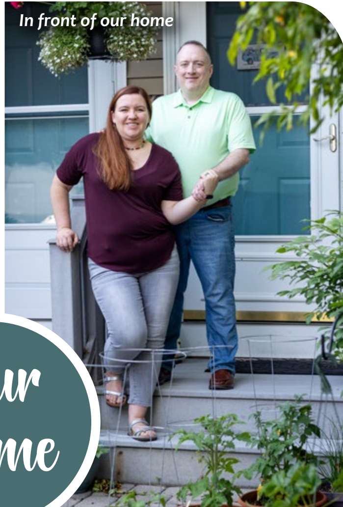
In front of our home

W e live in a wonderful townhouse which is perfect for our lifestyle. We are within walking distance of parks and schools. We have been working, slowly but surely, to update our home. We have learned many home improvement skills, and among other skills, we are now experts at stripping wallpaper!