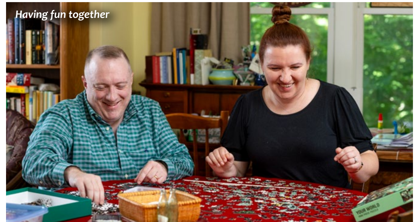
Having fun together

“ We love going to different places and usually take one “big” trip each year, and visit friends and family in other states regularly. ”