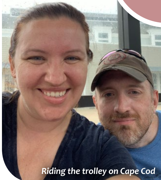
Riding the trolley on Cape Cod

The pandemic brought us even closer together and after being cooped up in a small apartment for several months, we started house-hunting. We found a place that was just right for us and began making it ours. We enjoy having space for our friends and family to visit with us. Our home is filled with love.