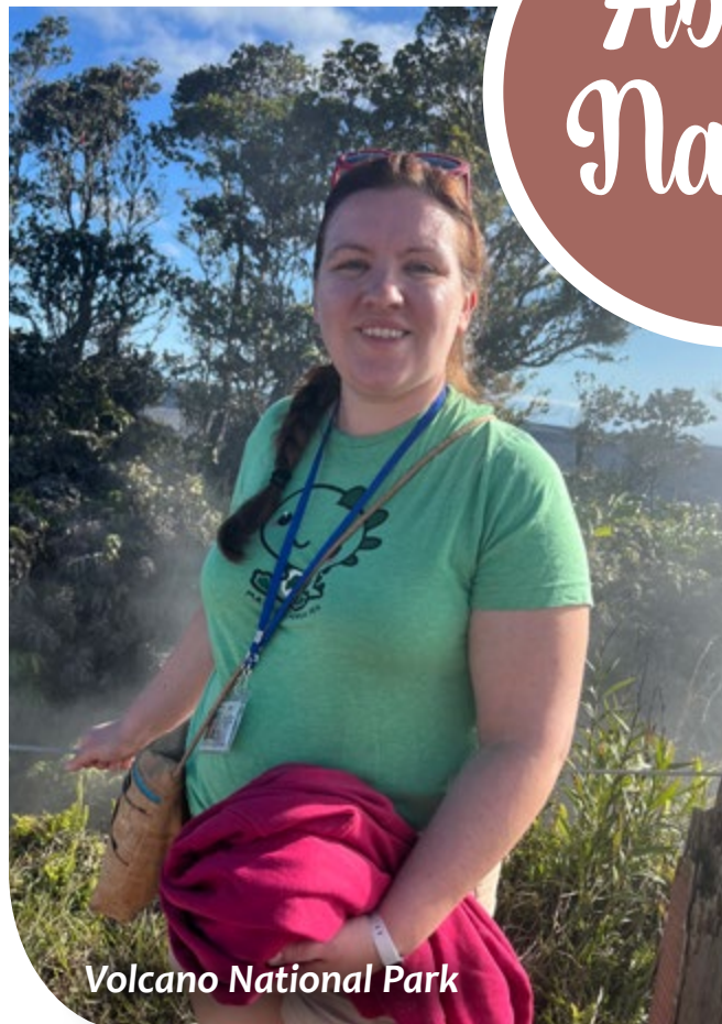
Volcano National Park

She designed an epic treasure hunt birthday party, created crafts for my brother and me to do, and made special holiday presents and cards. I cannot wait to share activities and surprises with our child, like those that my grandmother and mother offered.