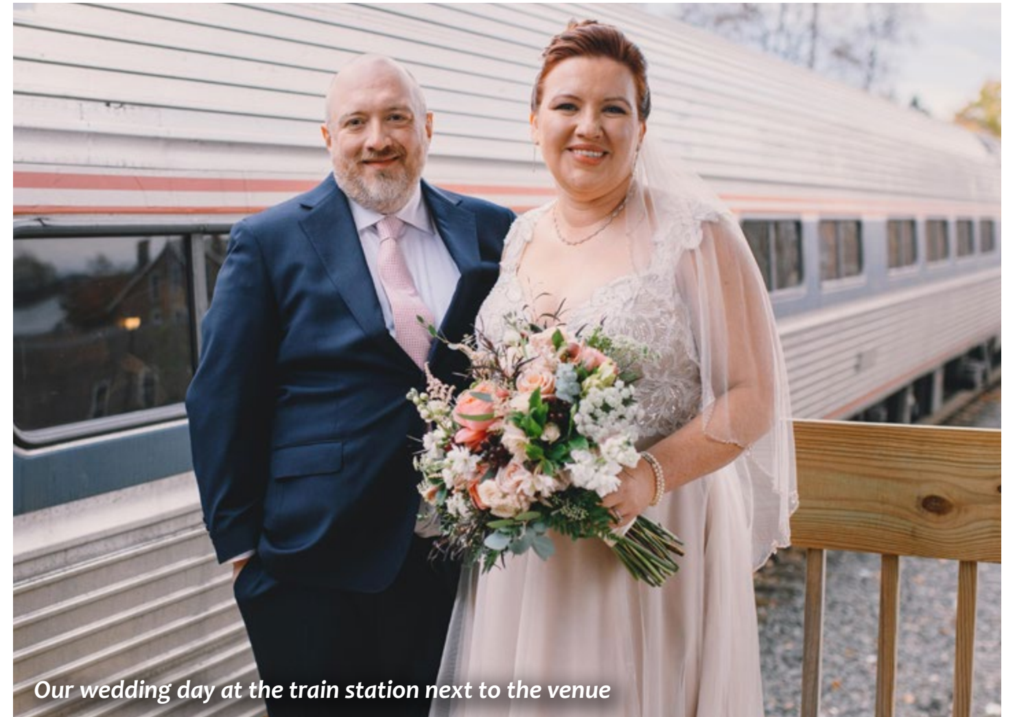
Our wedding day at the train station next to the venue

Now that we are happy and settled in our life together, our greatest desire is to become parents and share our love with a child. We are unable to have biological children and we are hoping to fulfill this desire through adoption. Naomi's mother was adopted and she was always open about how she joined her family, so we are comfortable with adoption.