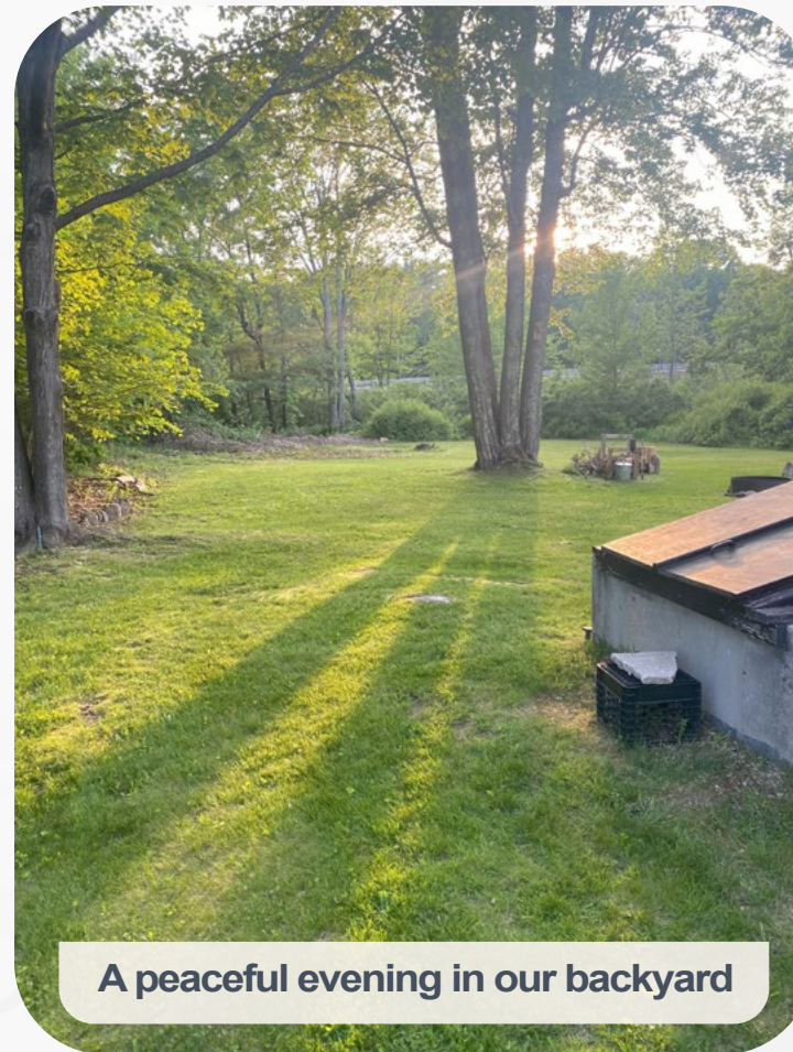
A peaceful evening in our backyard

Our home is a peaceful space, filled with light and love, space to play outside, and room to grow, dream, and feel safe.