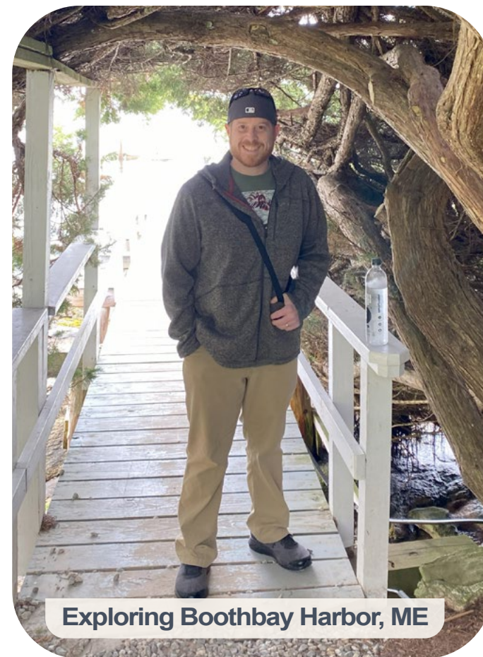
Exploring Boothbay Harbor, ME

He enjoys being outdoors, spending time in nature, and watching just about every New England sport on TV. It’s not uncommon for him to have a game on the TV and another streaming on his phone—he’s that passionate. He also has this charming habit of whistling around the house, just like his late grandfather used to—a small, sweet tradition that brings a smile to my face every time.