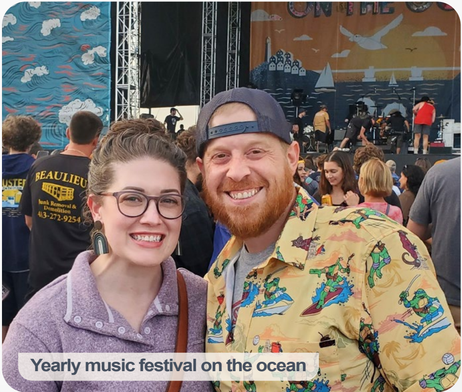
Yearly music festival on the ocean

Growing up in Massachusetts and Maine, we both experienced family traditions that were deeply tied to the changing seasons. Holidays meant gathering with loved ones, playing games, sharing stories, and creating memories that still bring us comfort. Each celebration had its own special foods and rituals, and discovering we had some of these in common made those early connections between us even more meaningful.