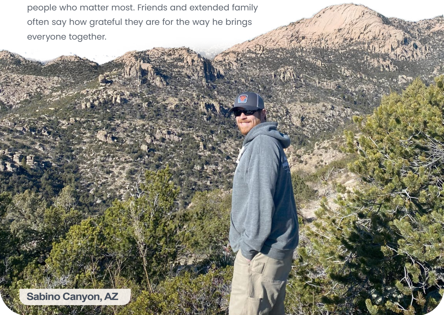
Sabino Canyon, AZ

Deeply passionate, creative, and driven, he’s a talented chef who has worked incredibly hard to get where he is. He enjoys cooking or baking delicious treats in our home kitchen. He pours himself into everything he creates, and sharing meals with others is one of his favorite ways to show love. He prioritizes relationships and stays close with the people who matter most. Friends and extended family often say how grateful they are for the way he brings everyone together.