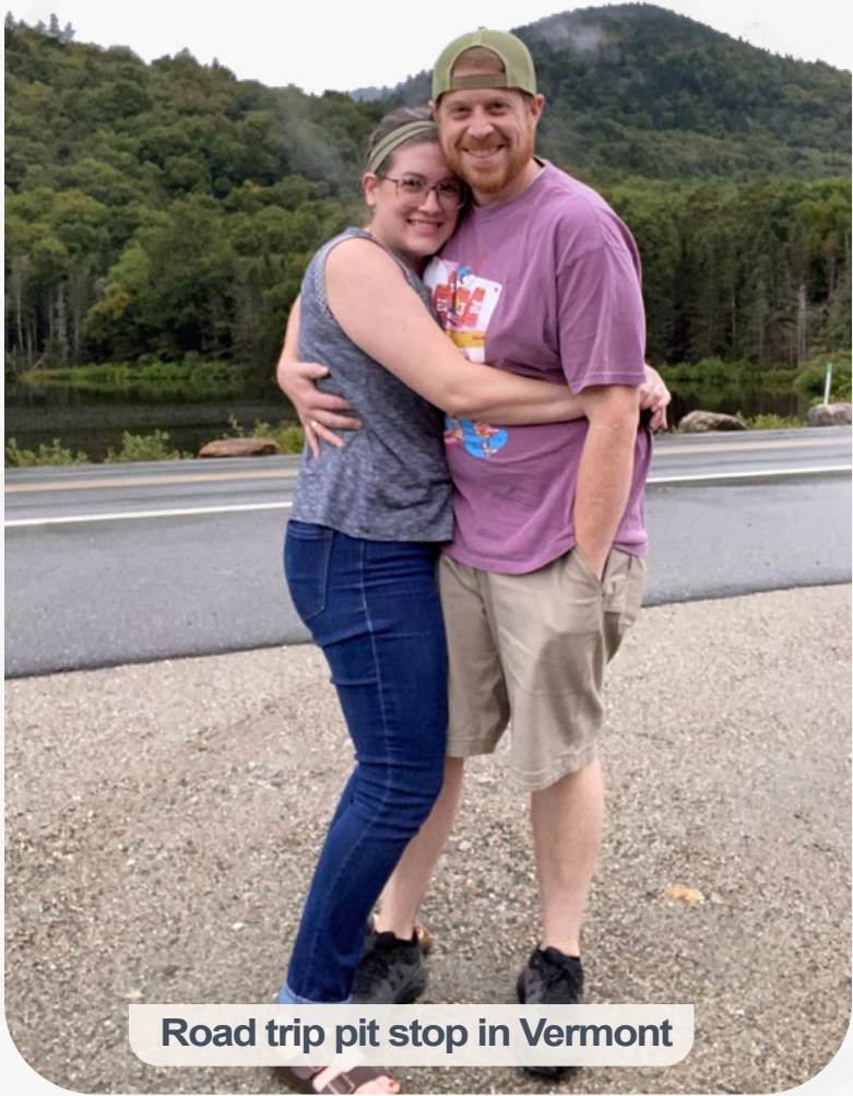
Road trip pit stop in Vermont

We're excited to carry these traditions forward and to create new ones as a family. Whether it's an evening walk, a weekend camping trip, or a big holiday gathering, we look forward to time spent together in ways that feel meaningful, relaxed, and fun. Our hope is to offer a home where experiences are shared, values are passed along, and lasting memories are made.