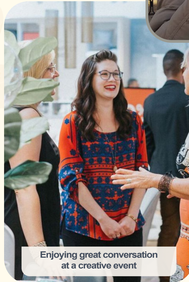
Enjoying great conversation at a creative event

Every space she designs carries her personal touch, always leaving a lasting impression. She fills our home with a special light through her artwork and love of plants. Her love for nature and color really comes to life in our gardens, organized so that there are continuous blooms in the spring and summer. She has created a small, handmade jewelry business, turning textiles and materials from her design field into stunning, meaningful pieces.