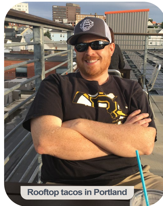
Rooftop tacos in Portland

I know without a doubt that these qualities (his devotion, energy, and huge heart) will make him an amazing father.