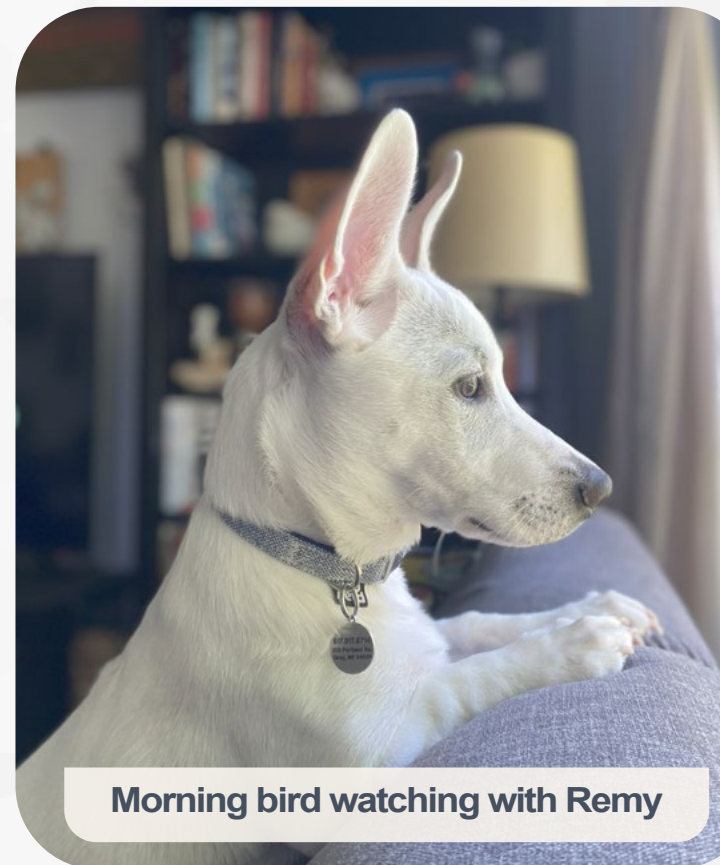
Morning bird watching with Remy

Just minutes from our house, is access to hiking and walking trails, playgrounds, parks, shopping centers, and medical facilities. It's just as easy to enjoy a night out in the city as it is to host a backyard cookout with friends. We're centrally located, with easy access to the coast, mountains, and lakes, making it simple to enjoy all that Maine has to offer.