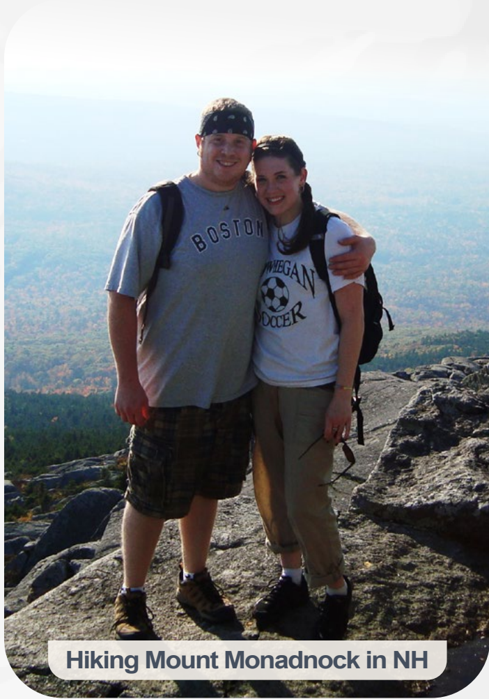
Hiking Mount Monadnock in NH