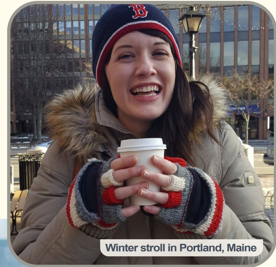
Winter stroll in Portland, Maine

She has worked hard and channeled her creativity into becoming a highly talented interior designer.