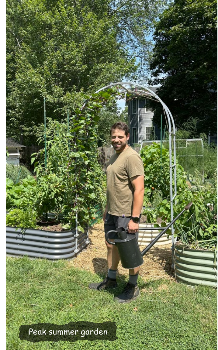
Peak summer garden

Living in our town provides the best of all worlds, because our quiet neighborhood has access to both the city and nature. We’re close to hiking trails, a short drive from beautiful ocean beaches, and a couple hours from the small cabin on our farm in the mountains of New Hampshire.