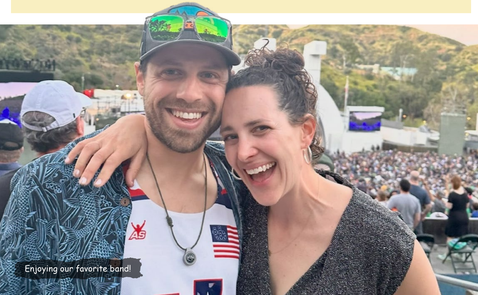
Enjoying our favorite band!

Thank you for reading our profile. Before sharing our story, we want you to know that whatever the future holds, we are wishing you the best in your path forward. Adoption is very close to our hearts and lives. Many of our friends and family members were adopted, have adopted siblings, and are adoptive parents. Our hope is to welcome you into our lives in ways that feel supportive for you. We deeply respect your decision to consider this path.