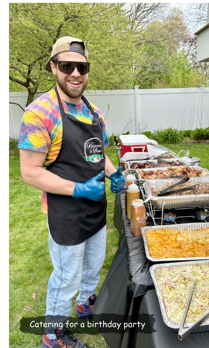
Catering for a birthday party