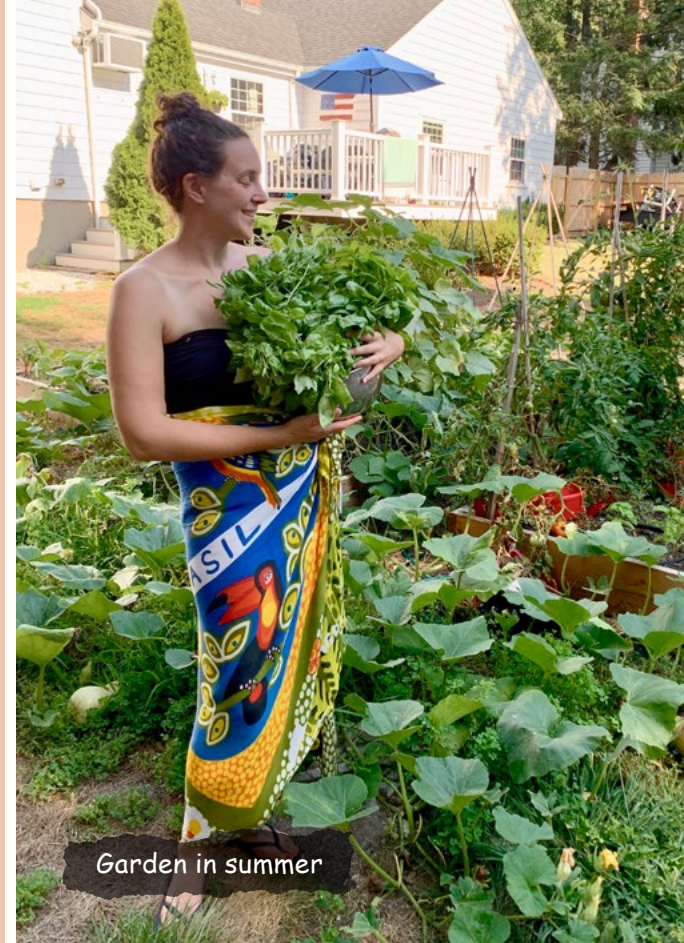
Garden in summer

Our street is quiet and the neighborhood is filled with many young families who have kids of all ages. We’ve made friends with neighbors who have young children. Our parents and many of our friends are a short drive from us. There is a public elementary school with a playground just a few blocks walk away, and trees and flowers everywhere.