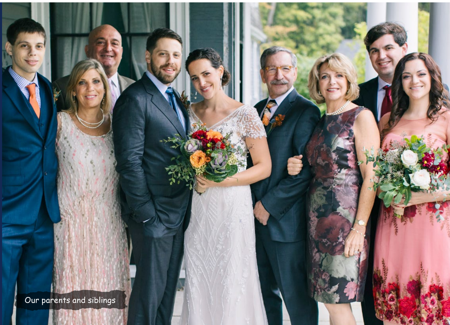
Our parents and siblings

Our friends are an extended family to us, which now includes their children.