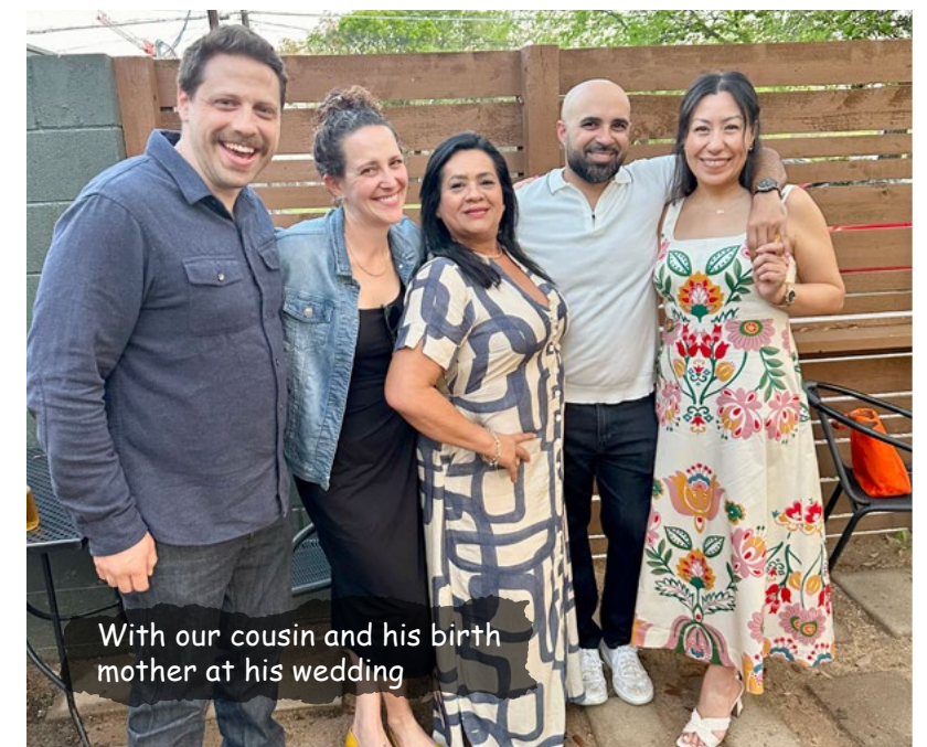
With our cousin and his birth mother at his wedding

Everyone is very supportive of our choice to have a family through adoption. Especially since adoption has touched our lives so directly, they know we understand how unique, complex, and meaningful it is to take this path.