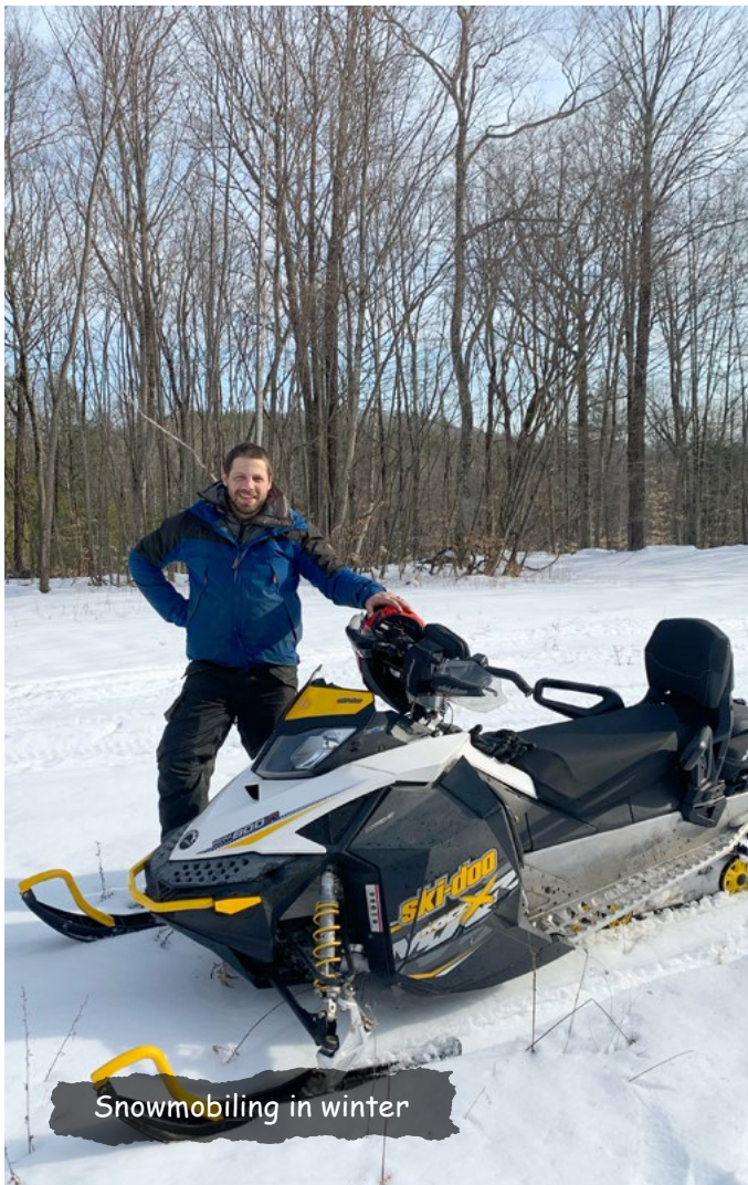
Snowmobiling in winter