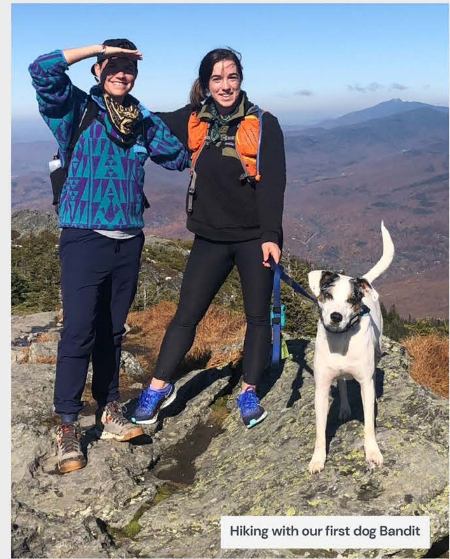
Hiking with our first dog Bandit