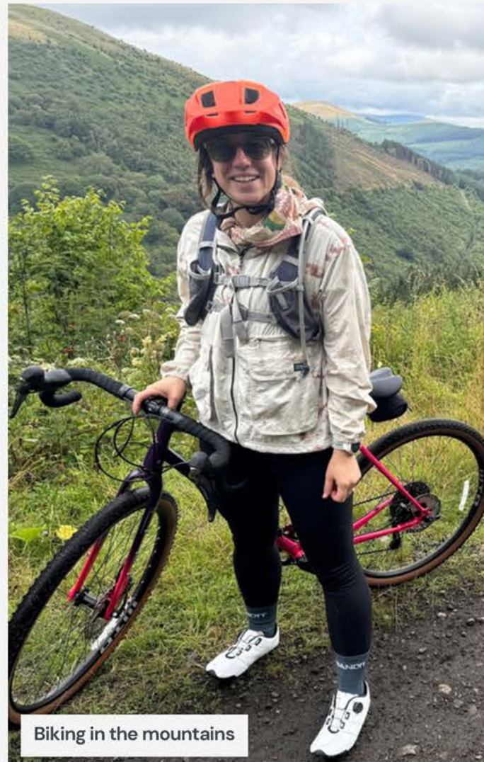
Biking in the mountains