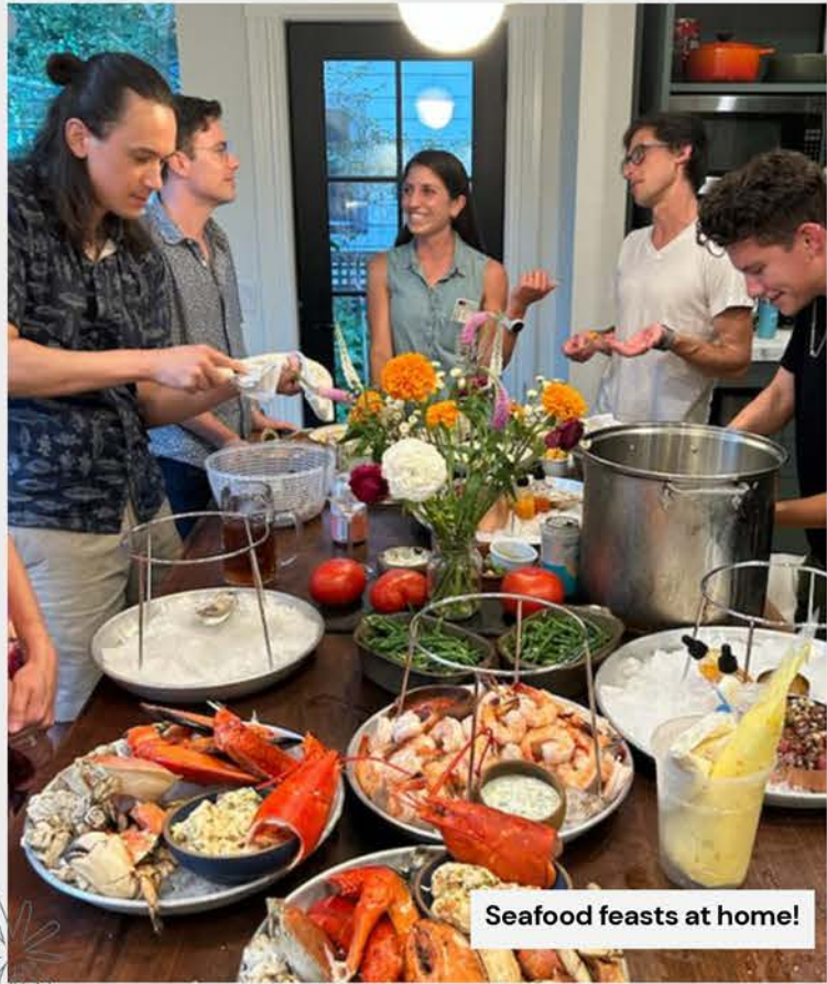
Seafood feasts at home!

Travel and adventure have always been a big part of our lives — it's actually one of the first things we bonded over. We both grew up with passports in hand, exploring new countries with our families and learning to love the feeling of landing somewhere totally new. That early sense of wonder stuck with us, and now we're always dreaming up our next adventure — whether it's hiking through a national park, getting lost in a new city, or just trying a new dish in our own neighborhood. We can't wait to share that same curiosity and joy with a child.