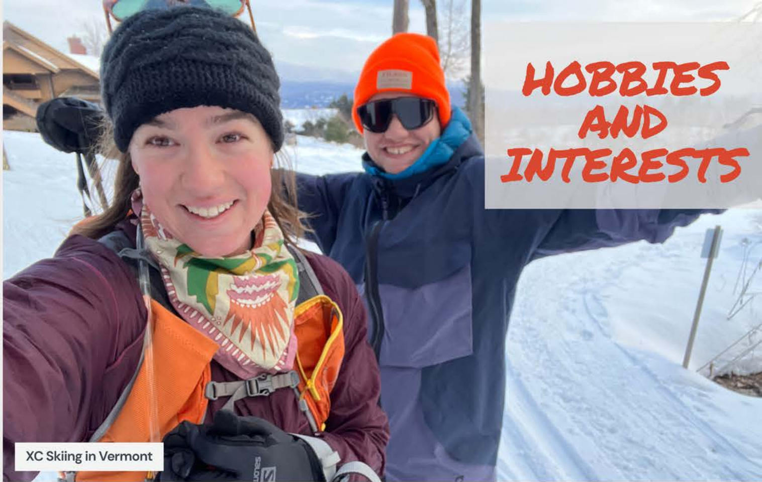
XC Skiing in Vermont