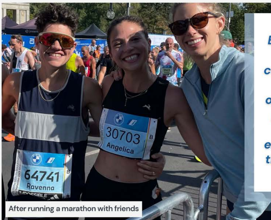
After running a marathon with friends

Being surrounded by different cultures taught me to be curious, open-minded, and proud of where I come from. I'm excited to share all these experiences with a child.