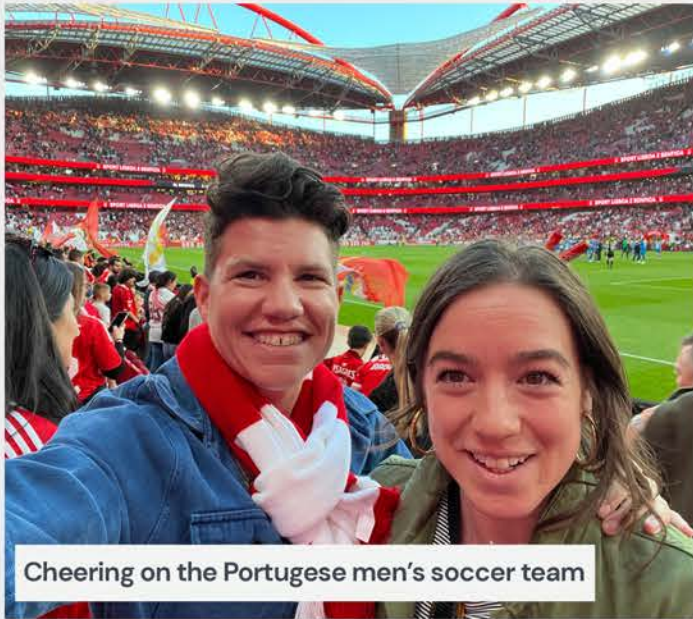
Cheering on the Portugese men's soccer team