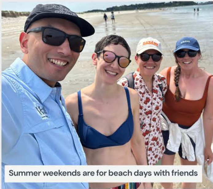
Summer weekends are for beach days with friends