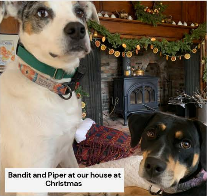
Bandit and Piper at our house at Christmas

We also love to spend time out at our vacation house near the coast. The dogs run around the backyard all day. We have a swing set and a big vegetable and flower garden, grape vines and apple trees. On special summer evenings, we watch movies in our barn with our friends and make s'mores at the fire pit. We bike to the beach, swim and paddle board in the ocean, and eat great seafood dinners at night on the screen porch.