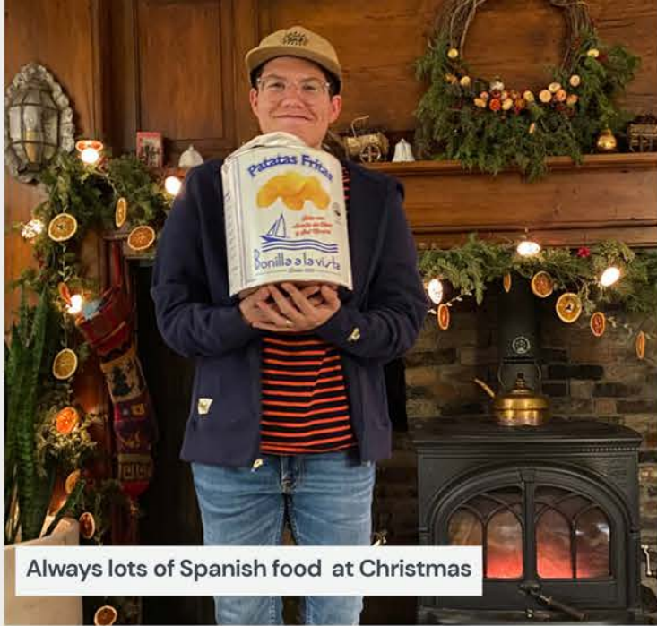
Always lots of Spanish food at Christmas

Summers are for slowing down and soaking up all the natural beauty when we visit Felicia's dad in Wales. We unplug, explore the countryside, and reconnect.