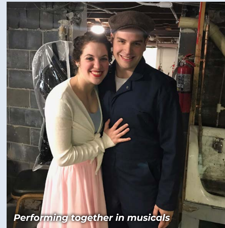
Performing together in musicals