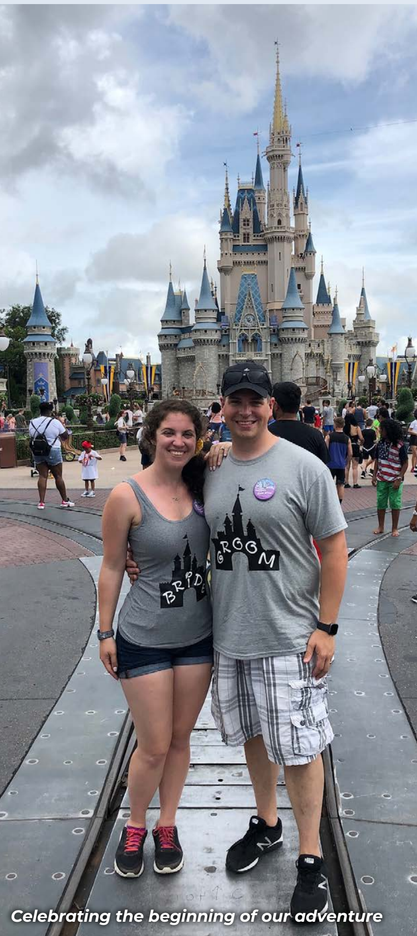
Celebrating the beginning of our adventure