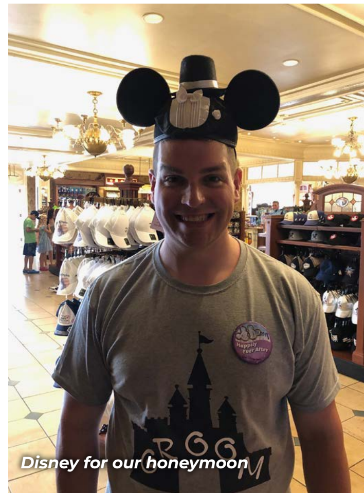
Disney for our honeymoon