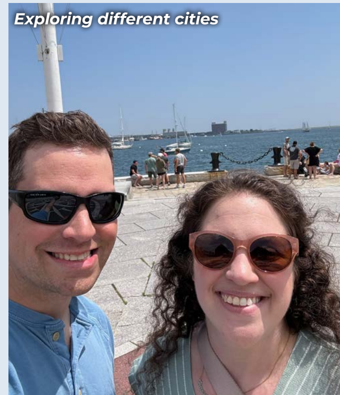
Exploring different cities

Together, we love finding new places to explore visually or as an activity.