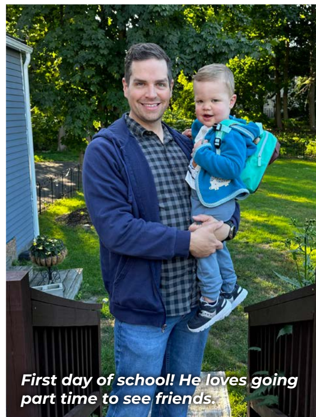
First day of school! He loves going part time to see friends.

Homes can house adventures, and those are never in short supply in our 1800s home. We have a perfect combination of living in an active area that's only a short drive to the water, the city, mountains, and farms, with many activities to choose from. We love how different one day can look from the next. We joke that we bought our house because we wanted our dog to have a backyard, but while she does love it, we do, too.