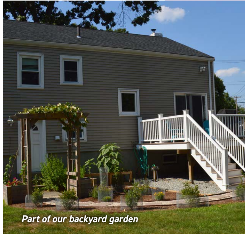
Part of our backyard garden

Our three bedroom house is located in a very desirable neighborhood in a diverse suburb of Boston. There is a secluded bike trail close to our house that we regularly use when we need to get some exercise or to take our son for a ride. There are two playgrounds within a 10 minute walk from our house that are often hopping with neighborhood kids playing games and riding bicycles. The town library, rec center and YMCA also host a huge variety of fun and educational activities for kids in which we regularly participate.