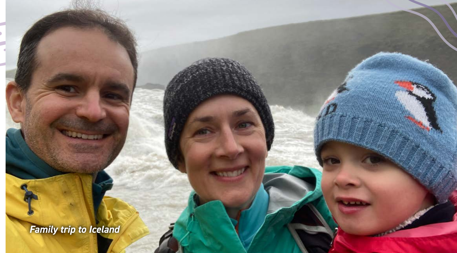
Family trip to Iceland