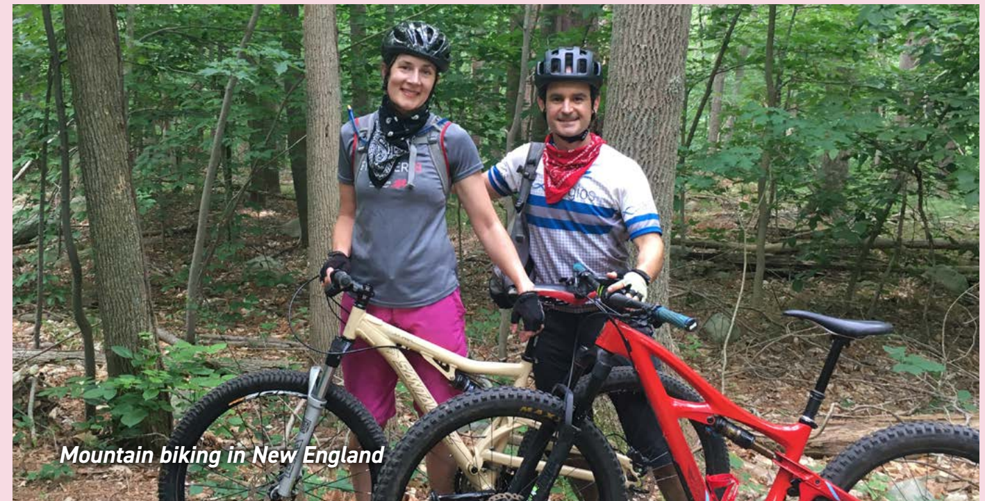
Mountain biking in New England