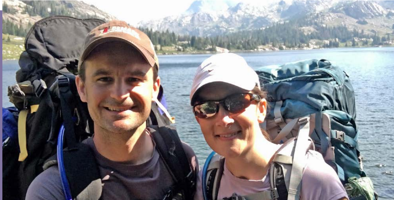
Backpacking in the Bighorns