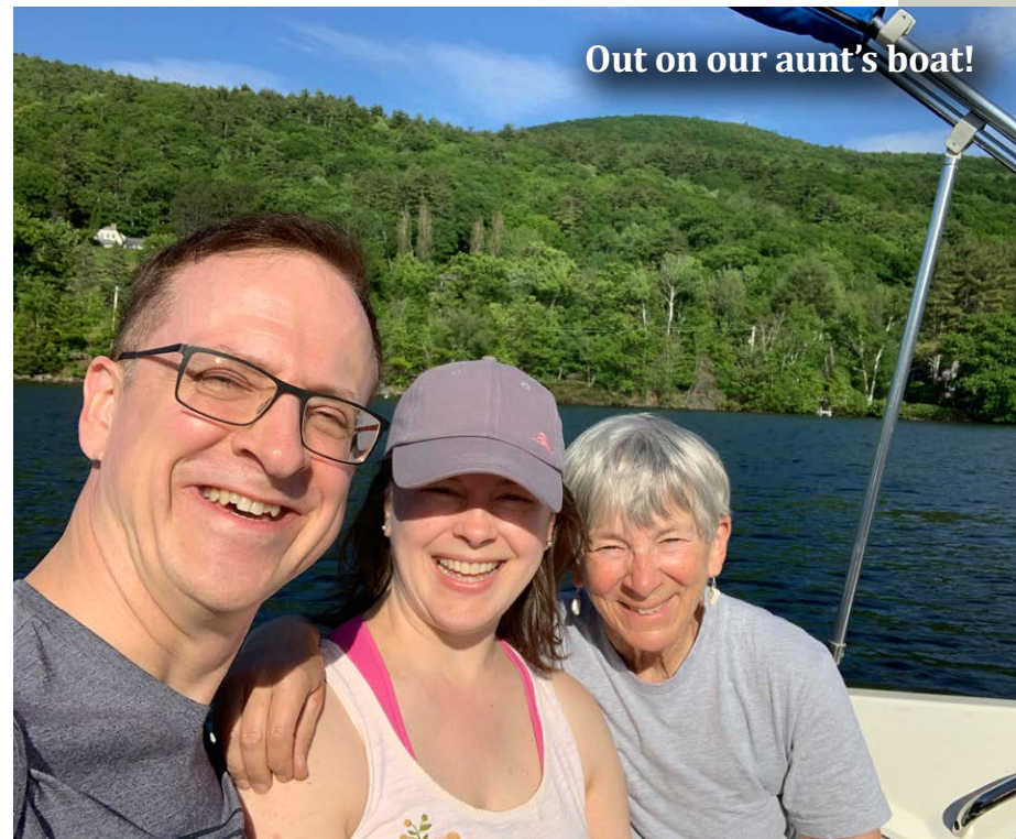
Out on our aunt's boat!

We've both been blessed with loving and supportive families whom we are very close to. Our parents consider one another "great friends"! So both our families come together for Thanksgiving and Christmas. The love and warmth is something you can really feel. We do a family trip together each winter – usually to Florida, where the sunshine and ocean are always welcome.