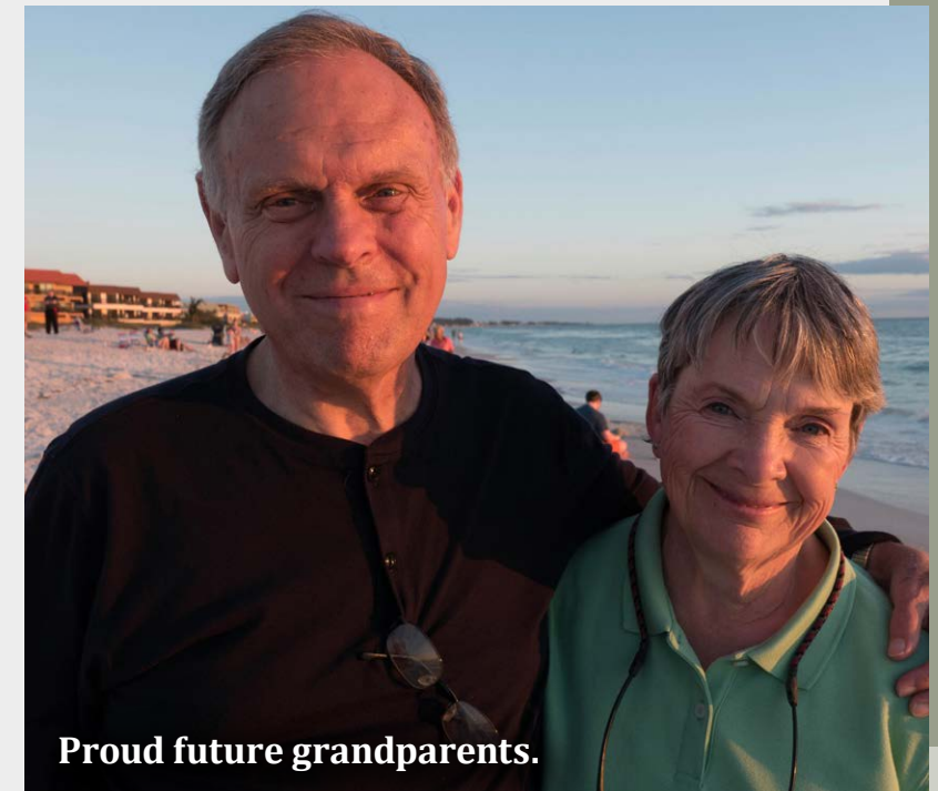
Proud future grandparents.

“ All of our friends and family are super excited for our adoption, which our families have had many amazing experiences with. ”