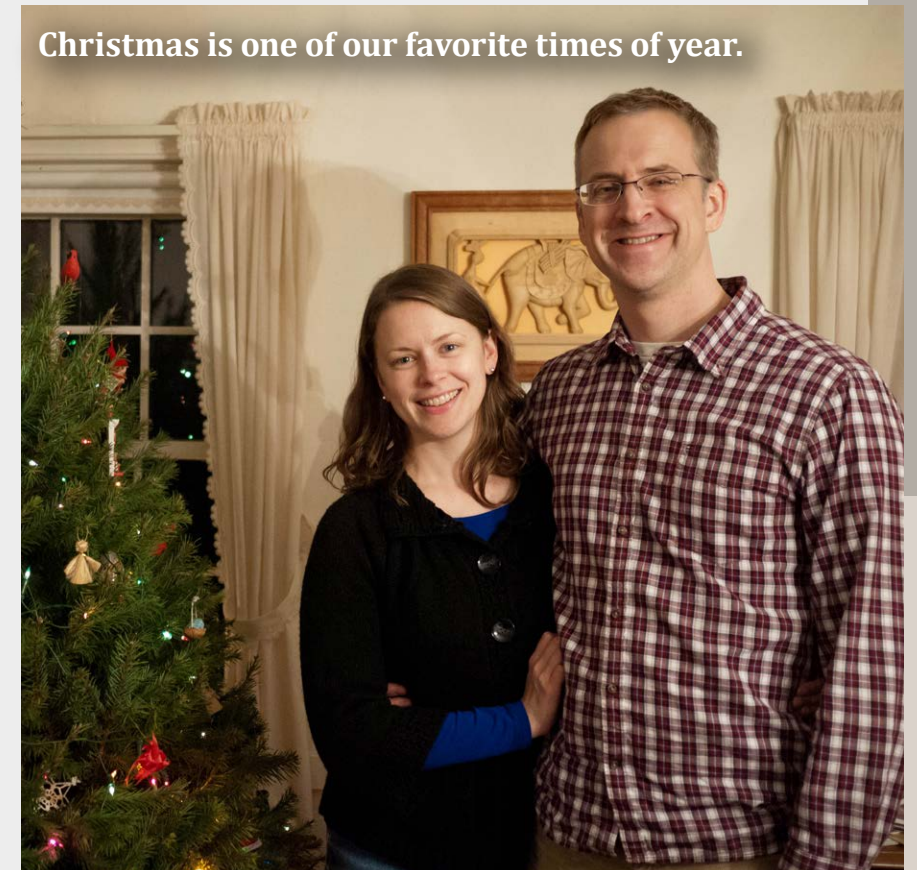
Christmas is one of our favorite times of year.

SUMMER: School's out, and it's time to relax. A highlight is always lake time at our parents' cabin: boating, playing board games, arts and crafts, time with family, and lots of swimming. Museums are a favorite way to skip the heat, and petting zoos and miniature golf are a must!