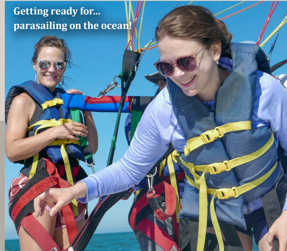
Getting ready for... parasailing on the ocean!

SPRING: Our neighborhood is full of flowers, and it's time for nature walks. Ice cream trucks park nearby and provide yummy treats for all. There's a campus Easter egg hunt just for the little ones. Outdoor concerts and cookouts are everywhere, and it's time to wade in the nearby river.