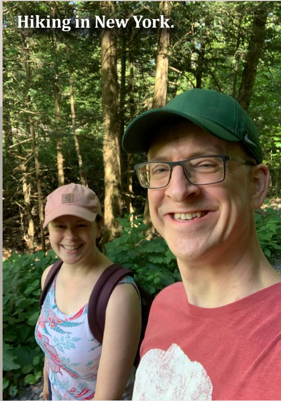
Hiking in New York.

FALL: Colorful leaves are everywhere, and it's time to hike! There's a hayride for the kids on campus, complete with hot chocolate and cider. At Thanksgiving time, the extended family gets together for hugs and a feast. It will be so much fun to have a little one join us for apple picking, too.