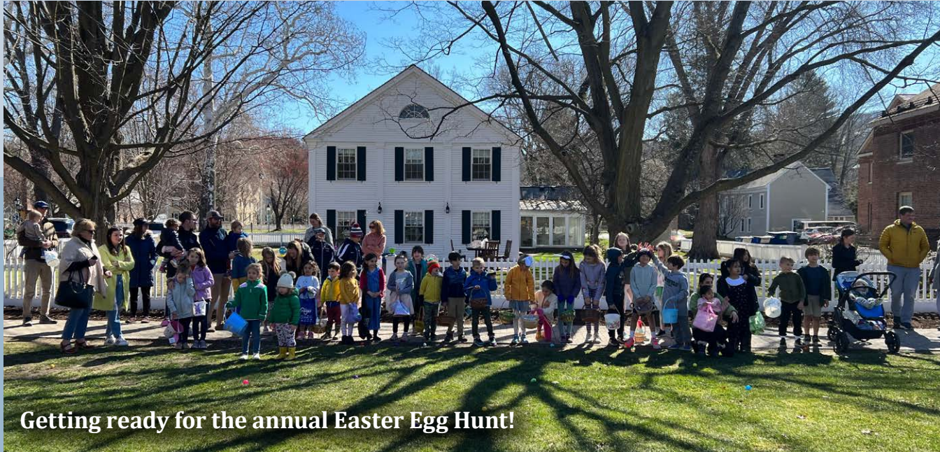
Getting ready for the annual Easter Egg Hunt!