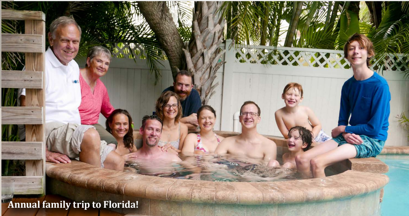
Annual family trip to Florida!

SPRING: Our neighborhood is full of flowers, and it's time for nature walks. Ice cream trucks park nearby and provide yummy treats for all. There's a campus Easter egg hunt just for the little ones. Outdoor concerts and cookouts are everywhere, and it's time to wade in the nearby river.