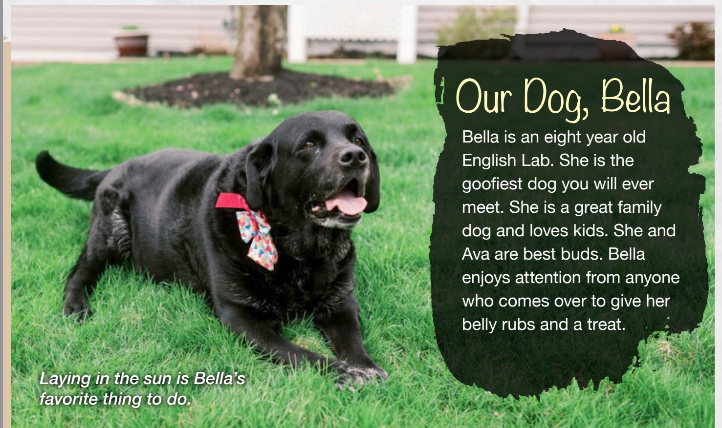
Laying in the sun is Bella's favorite thing to do.