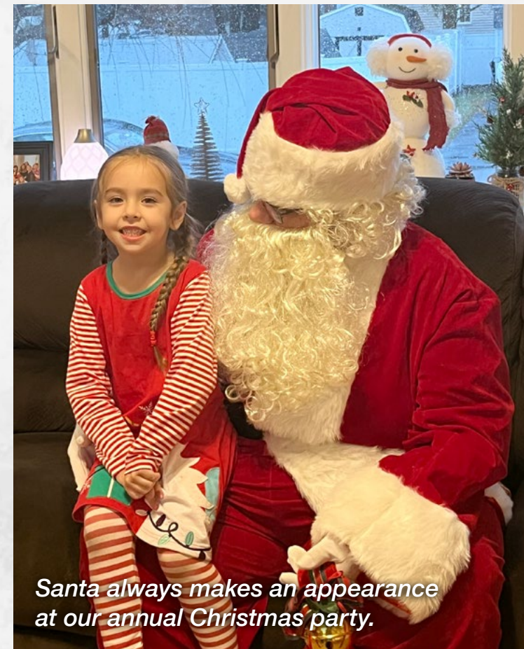
Santa always makes an appearance at our annual Christmas party.