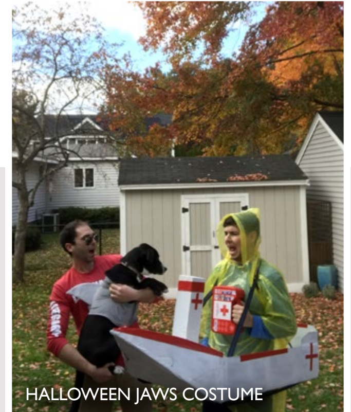
HALLOWEEN JAWS COSTUME

Following these major milestones, we feel that our lives are established, and we are excited to grow our family. Being two men, we knew that our family-planning options were limited, but from as early on as our first date, we both shared the dream of building a family and raising children. Now ready to take those steps, we are so excited to welcome a child into our lives through open adoption.