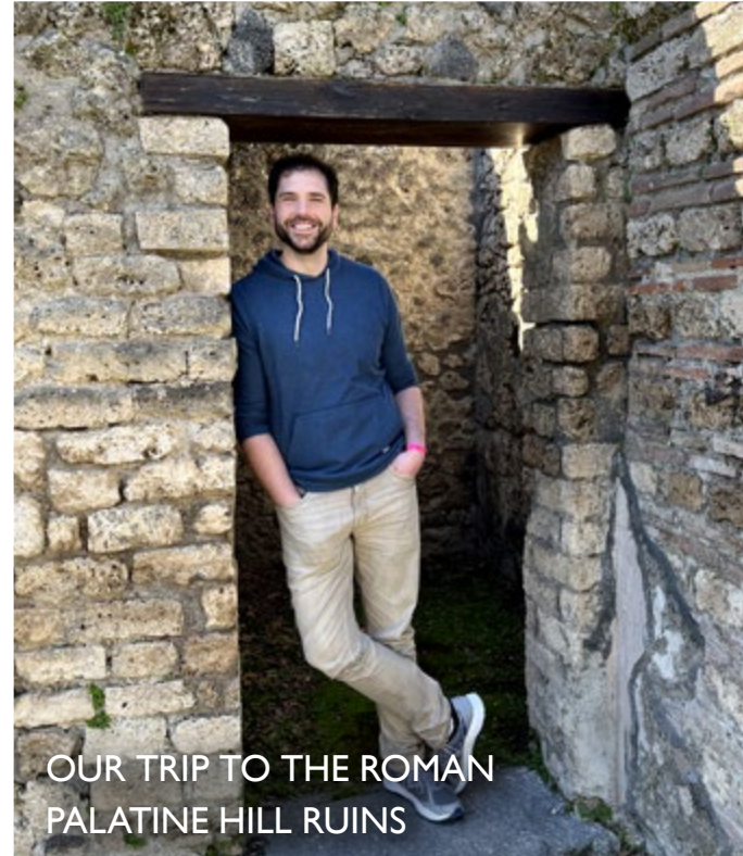
OUR TRIP TO THE ROMAN PALATINE HILL RUINS