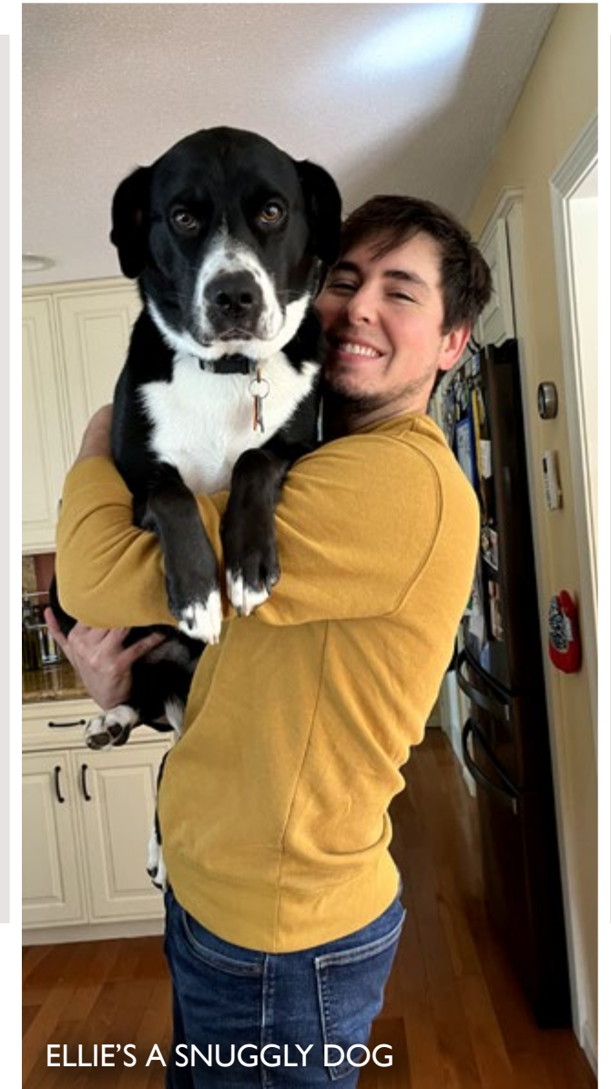
ELLIE'S A SNUGLY DOG

“We set out to find a home that could provide a safe environment for kids, and that's exactly what we found.”