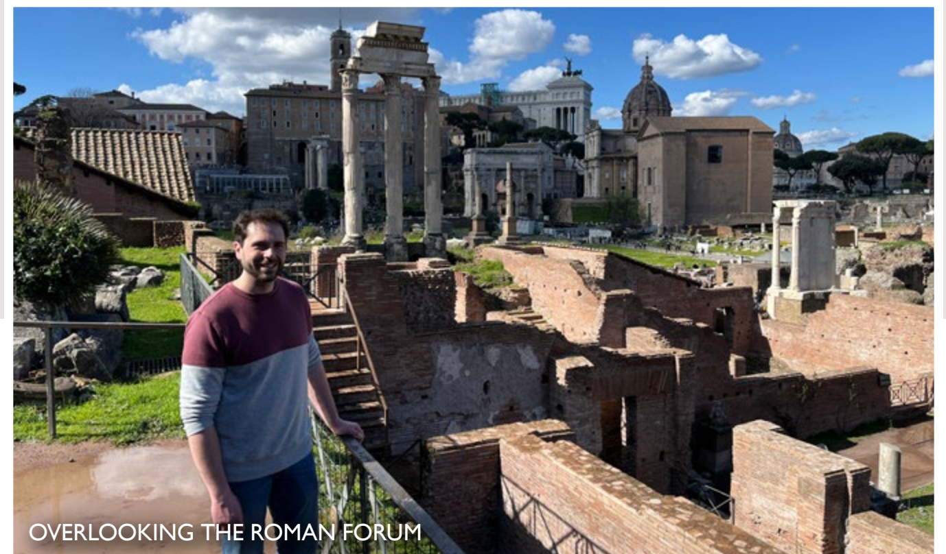
OVERLOOKING THE ROMAN FORUM