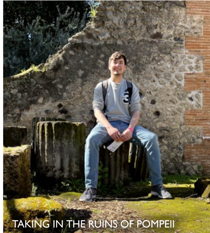
TAKING IN THE RUINS OF POMPEII

He's passionate about what he does, and you can always hear the excitement in his voice when he discusses a project he's been working on or a challenge one of his colleagues comes to him with. While I don't always understand exactly what he is talking about when he gets into the specifics of light particles and software programming, I am reminded how brilliant my husband is and how happy I am that he has a vocation he loves.