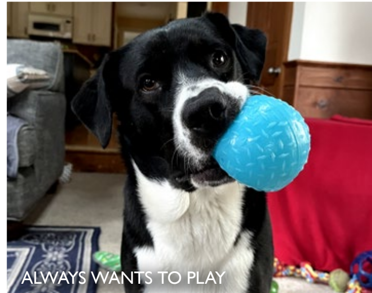
ALWAYS WANTS TO PLAY

Inside, we wanted to make our new house into our home and have tried our hand at light home improvement projects. Whether it is putting in hardwood floors, building our backyard deck, or replacing some windows, our construction and planning skills have certainly been put to the test, but we can happily report that each completed project has only helped us hone our DIY abilities and made it feel more and more like our forever home.