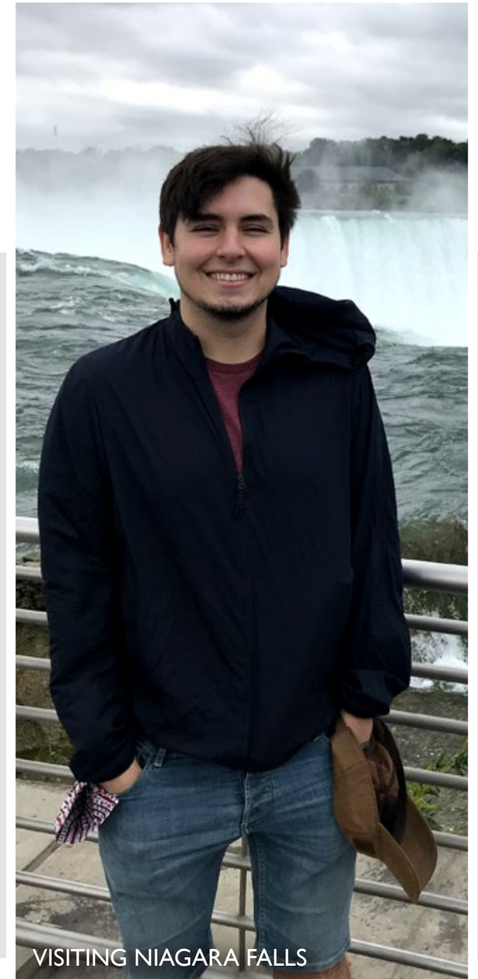
VISITING NIAGARA FALLS