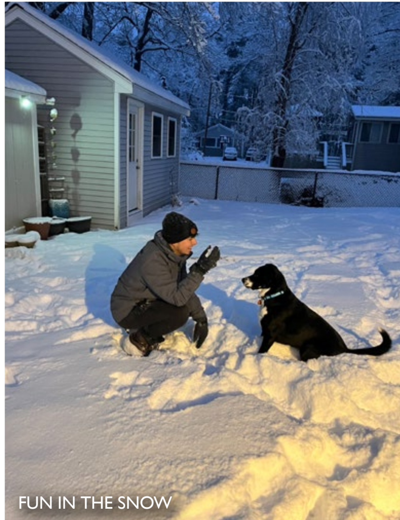
FUN IN THE SNOW

We were fortunate to find a beautiful home in a small, wooded town, continuously ranked among one of the best in the state for its education and career opportunities. The second we moved in, we knew we had joined a strong, tight-knit community, with neighbors who welcomed us, and who are always there to support or help or to offer the odd tool in home improvement and construction projects. We set out to find a home that could provide a safe environment for kids, and that's exactly what we found.