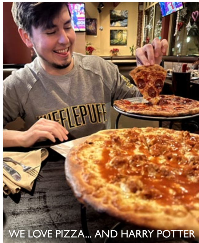
WE LOVE PIZZA... AND HARRY POTTER

After receiving an undergraduate degree in imaging science, he went on to get an advanced degree in software engineering, combining his love of light and photonics with programming and coding.