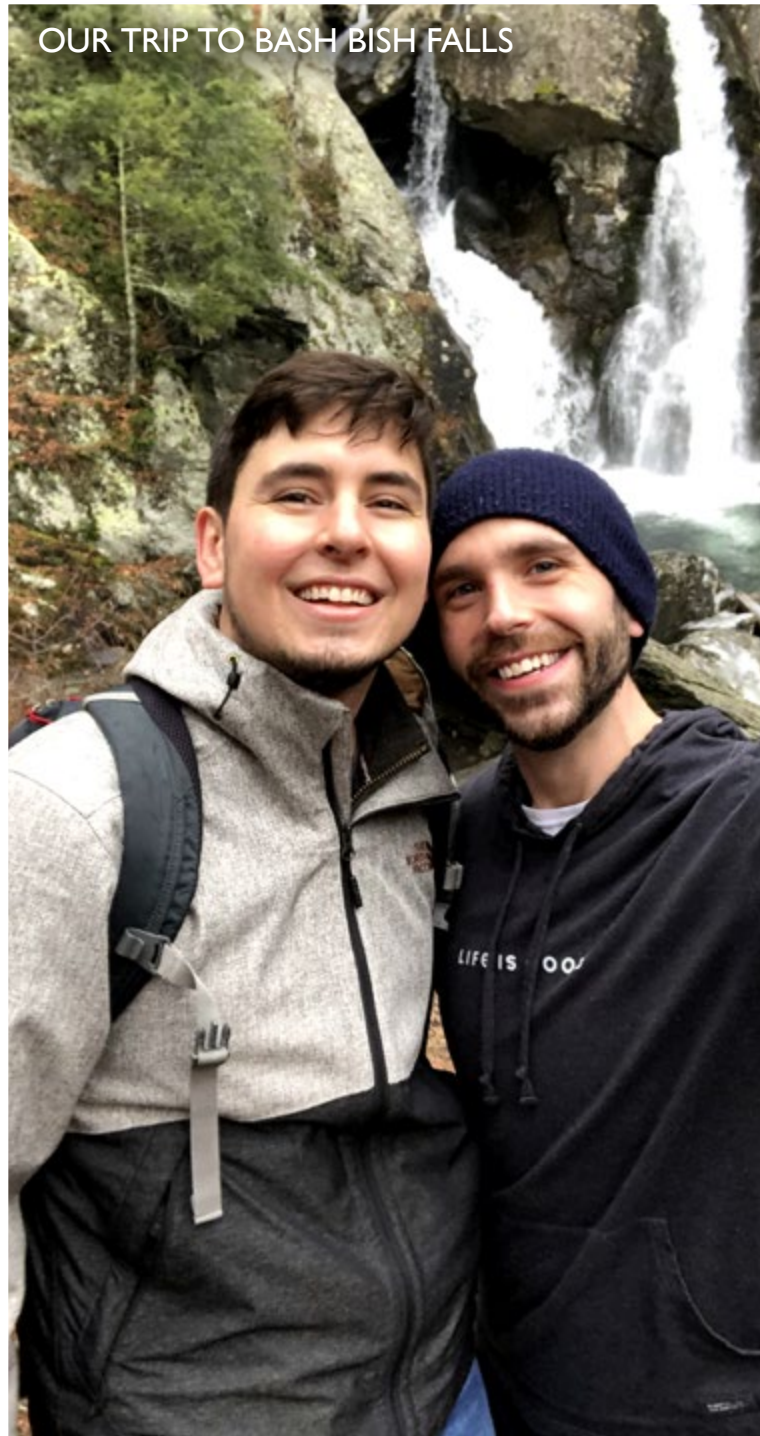
OUR TRIP TO BASH BISH FALLS

We continued to build our lives together, buying our house in 2021, getting engaged by early 2022, and marrying later that same year in an intimate ceremony with our close friends and family. The best addition to our family so far (besides each other) was our wonderful puppy, Ellie, whom we rescued just a few months after buying our house.