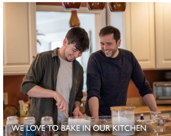
WE LOVE TO BAKE IN OUR KITCHEN