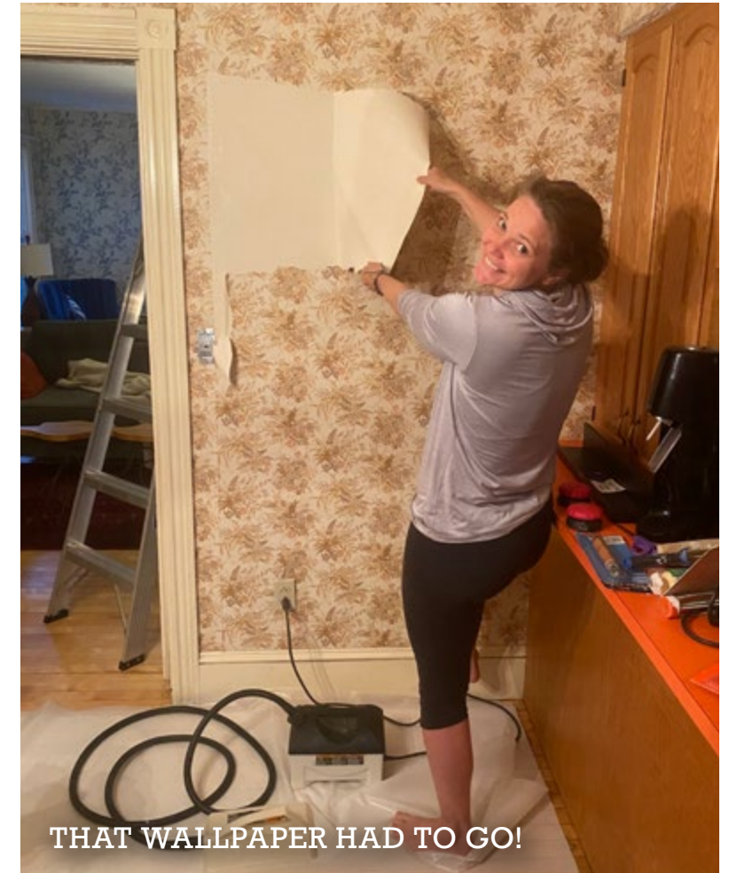
THAT WALLPAPER HAD TO GO!

We live only a short walking distance from the local pool and an incredible children's museum, which has made our home a popular destination for our friends in Boston with children. Portland is a city with a small-town feel, and we are close to nature and beaches. Portland's racial and ethnic diversity continues to grow, with a significant population of new Mainers hailing from West Africa. We can't wait to take a child to the Eastern Promenade, a local open space hang-out with playgrounds, fields, and food trucks which is always full of families from all backgrounds.