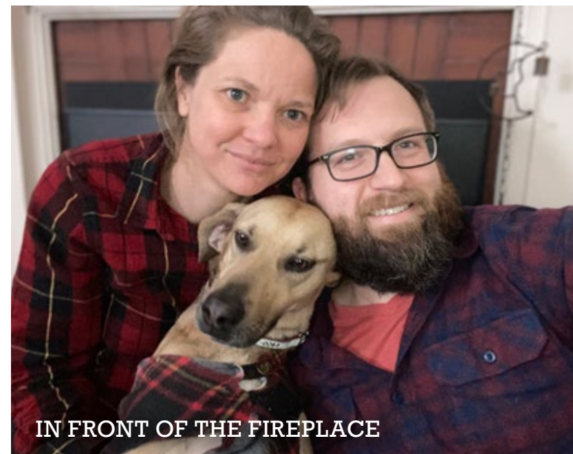
IN FRONT OF THE FIREPLACE