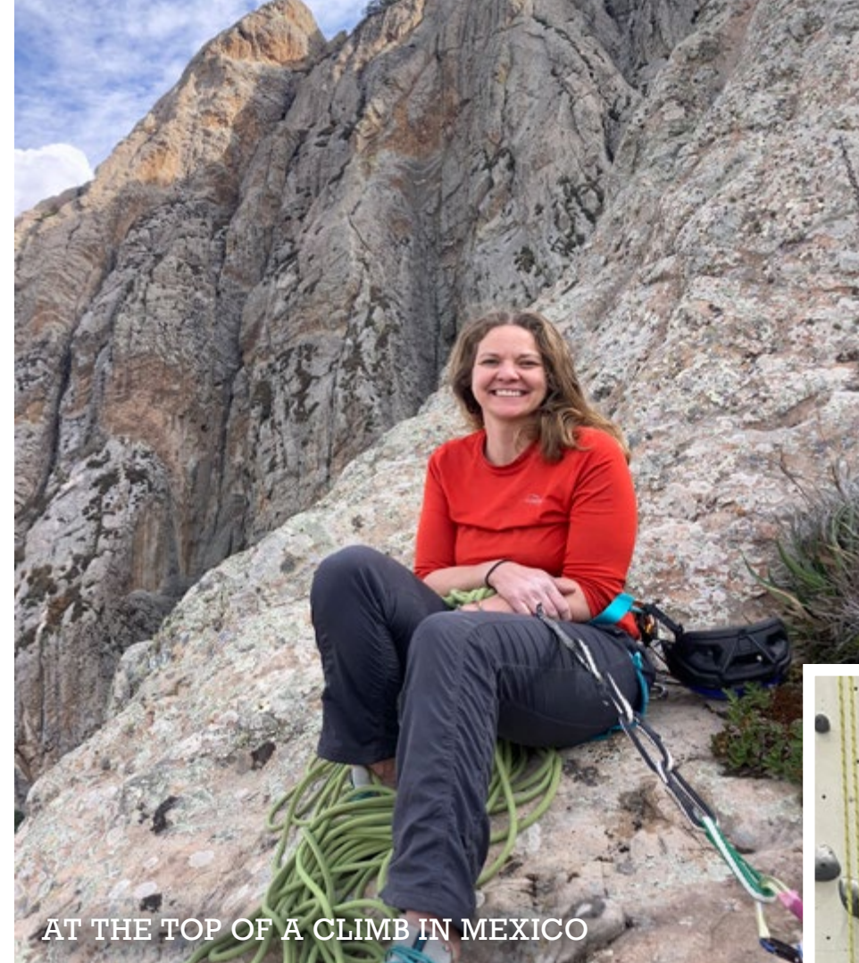
AT THE TOP OF A CLIMB IN MEXICO