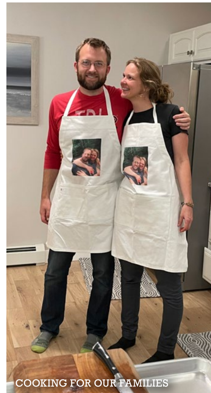
COOKING FOR OUR FAMILIES

We both appreciate our time reading and tend to close out our days with a book in hand. In the winter, we always have a fire going and sit in front of it to read and unwind. We will share our love of books by reading our favorites to the child whom we adopt every night.