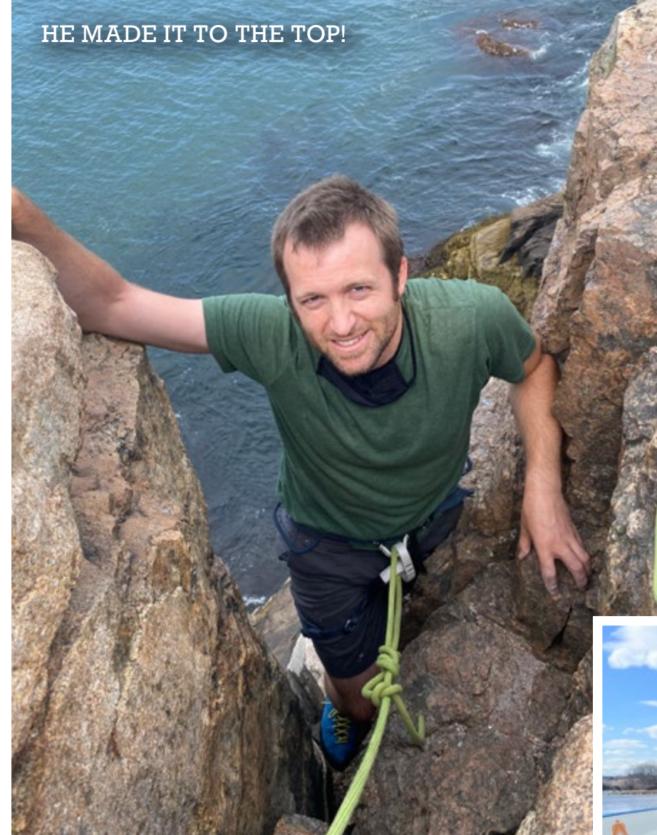
HE MADE IT TO THE TOP!