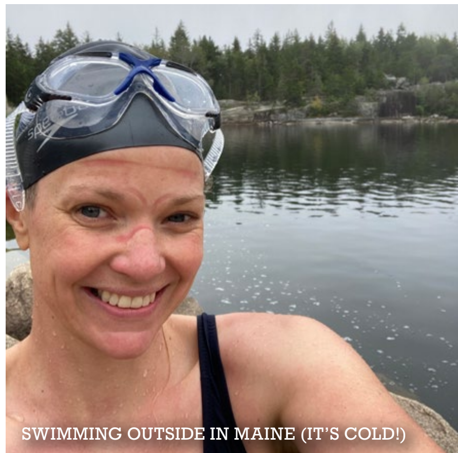
SWIMMING OUTSIDE IN MAINE (IT'S COLD!)

We both love hiking, biking, and canoeing and are eager to bring a child into nature with us. Each year we go on a backpacking trip, disconnecting from the digital world, and focusing on what's at our feet, or taking the time to admire a beautiful sunset. We can already imagine the wonder in a child's eyes as they learn of the world around them.