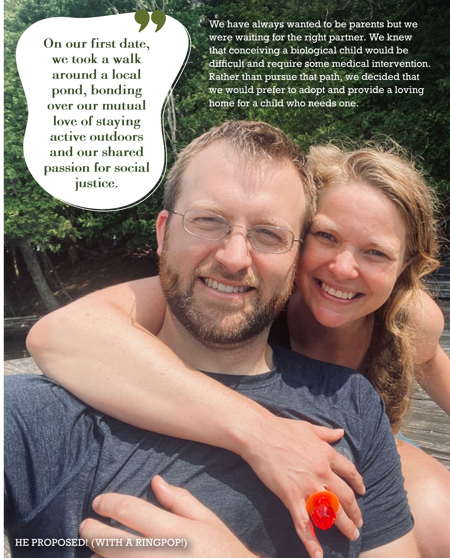
HE PROPOSED! (WITH A RINGPOP!)

We have always wanted to be parents but we were waiting for the right partner. We knew that conceiving a biological child would be difficult and require some medical intervention. Rather than pursue that path, we decided that we would prefer to adopt and provide a loving home for a child who needs one.