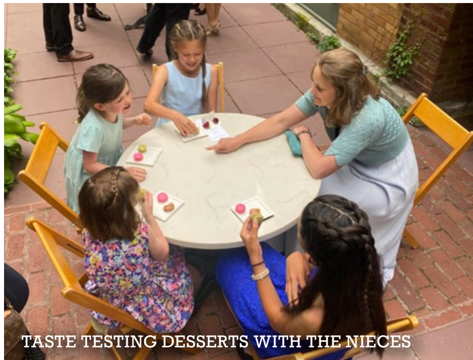
TASTE TESTING DESSERTS WITH THE NIECES