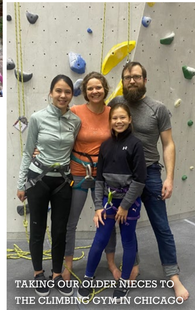
TAKING OUR OLDER NIECES TO THE CLIMBING GYM IN CHICAGO