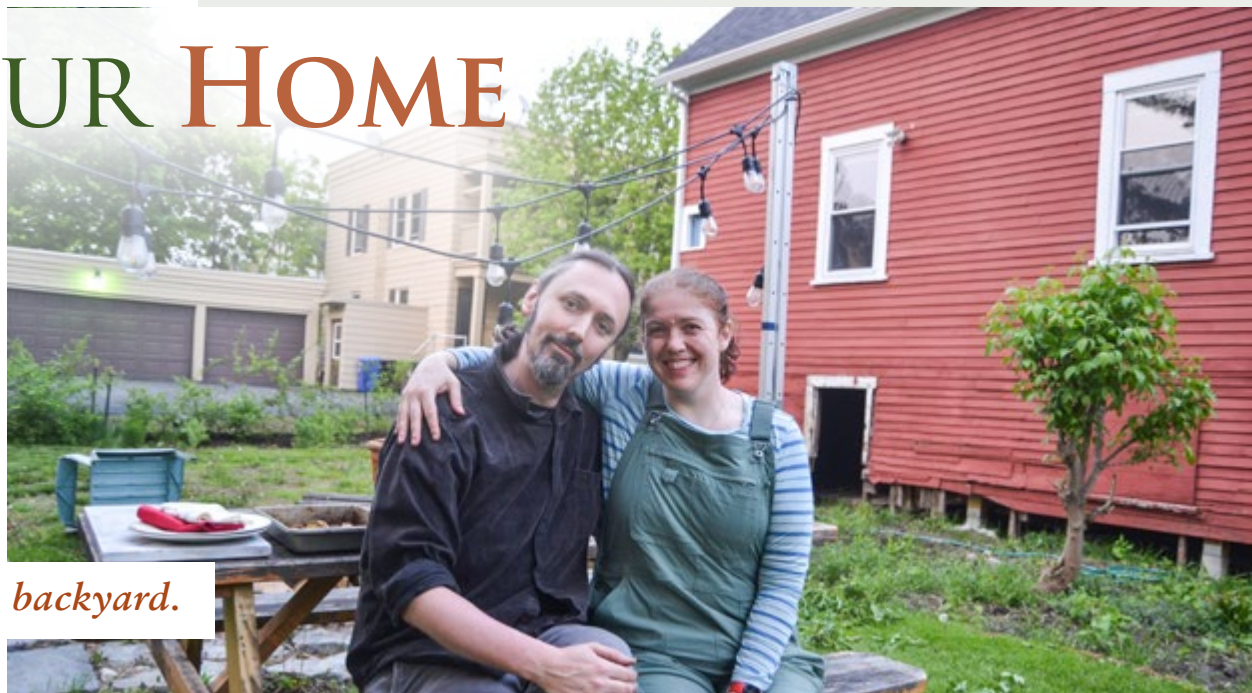
In the backyard.

In October of 2019, we purchased an old farmhouse built in 1861.