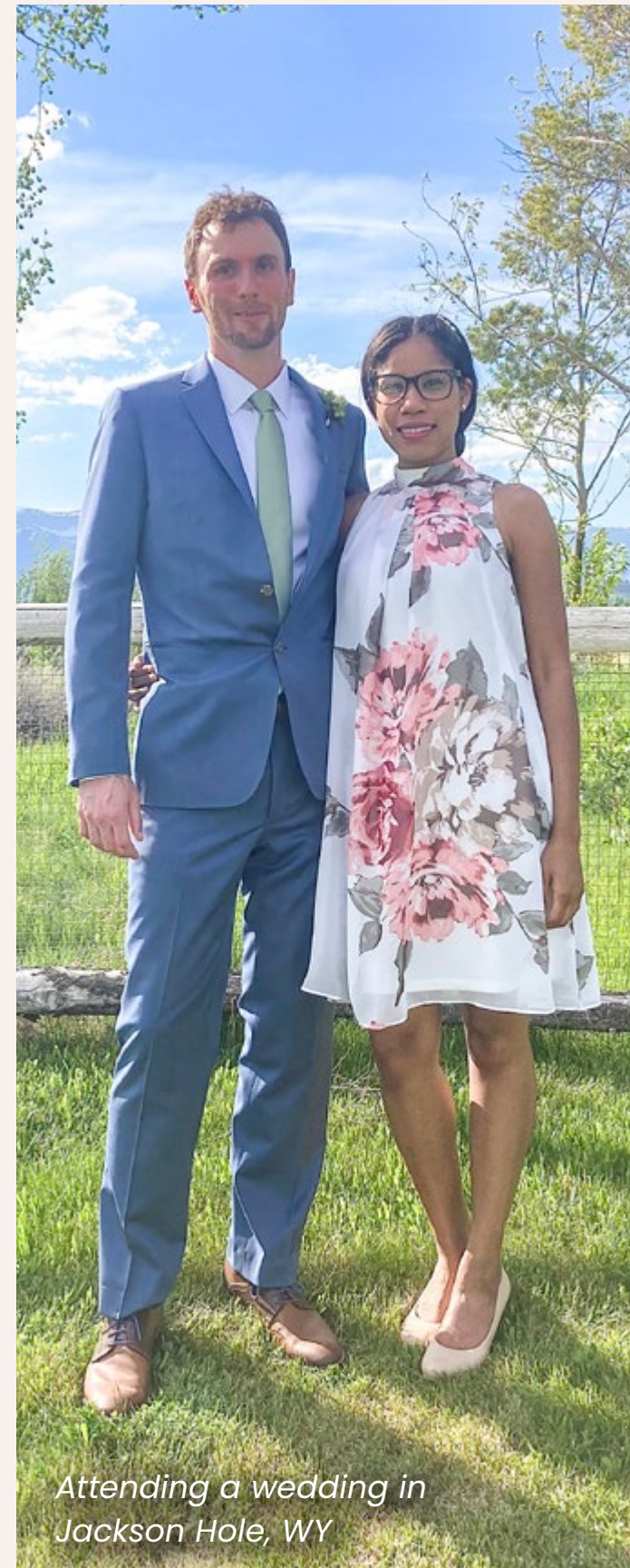
Attending a wedding in Jackson Hole, WY

The story of our relationship began, oddly enough, during an emergency. When we met in 2017, we worked for the same disaster response agency, and our paths first crossed while responding to an incident in New York City. As we spent more time together and got to know one another better, it became clear we had a special connection. It wasn't long before we started dating and eventually moved in together, sharing a tiny studio apartment! As our careers developed, we moved to New England, bought our first house here, added Finn (our mini dachshund) to our family, and married in the summer of 2022.