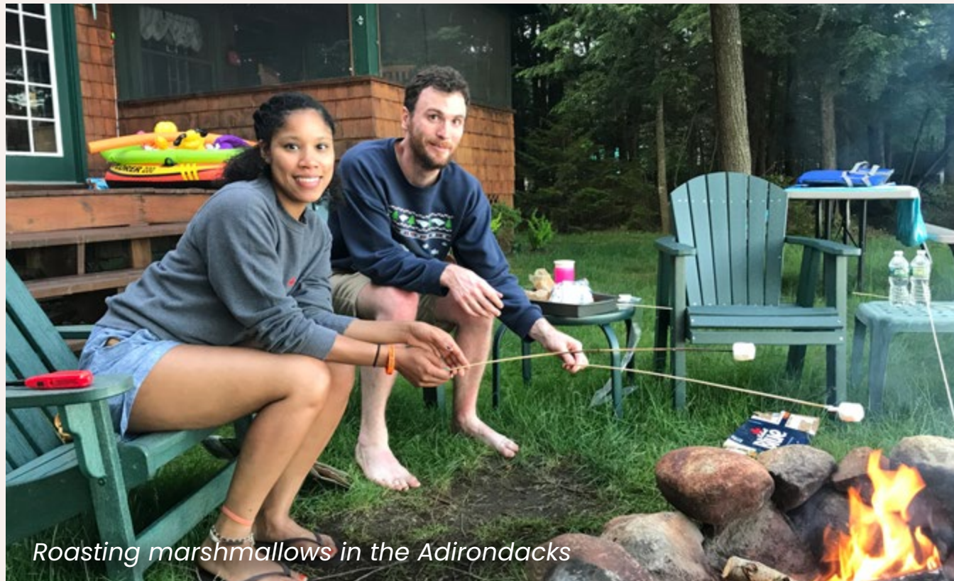
Roasting marshmallows in the Adirondacks

and we appreciate you taking the time to learn more about us as prospective parents.