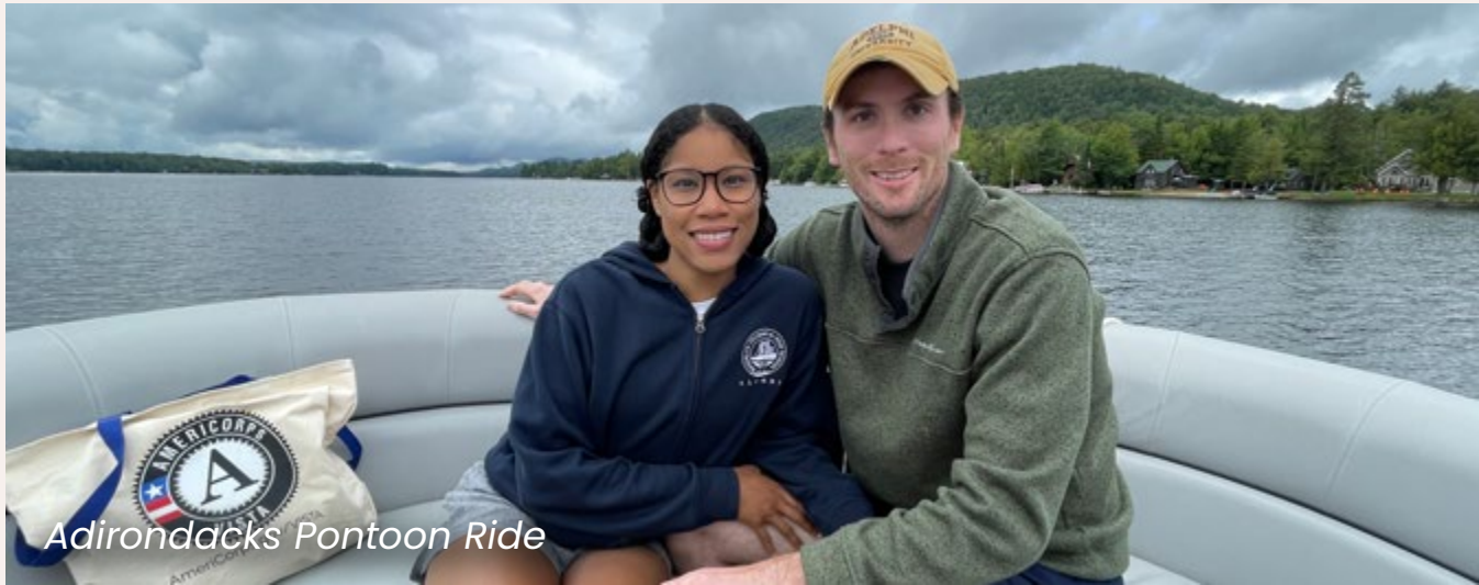
Adirondacks Pontoon Ride