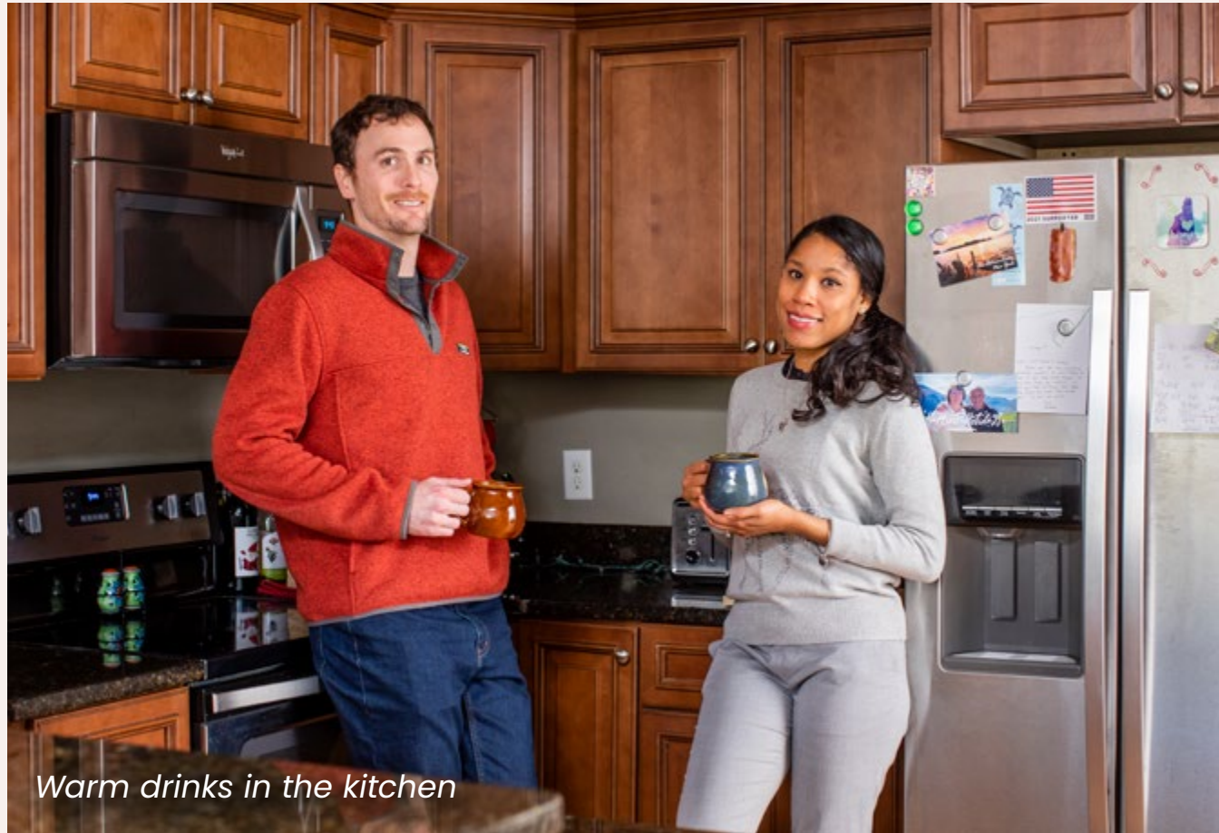
Warm drinks in the kitchen

Our townhouse-style home, built in 2015, has been the perfect place for us to grow into . We moved in in early 2022 and have since really enjoyed furnishing, decorating, and making the home our own. The Spring bloom is particularly beautiful, and we enjoy lounging on our deck when the New England weather doesn't keep us inside.