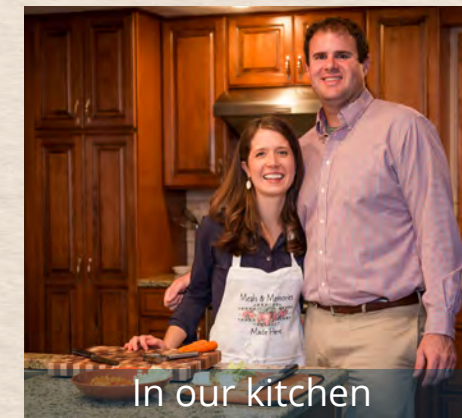
In our kitchen