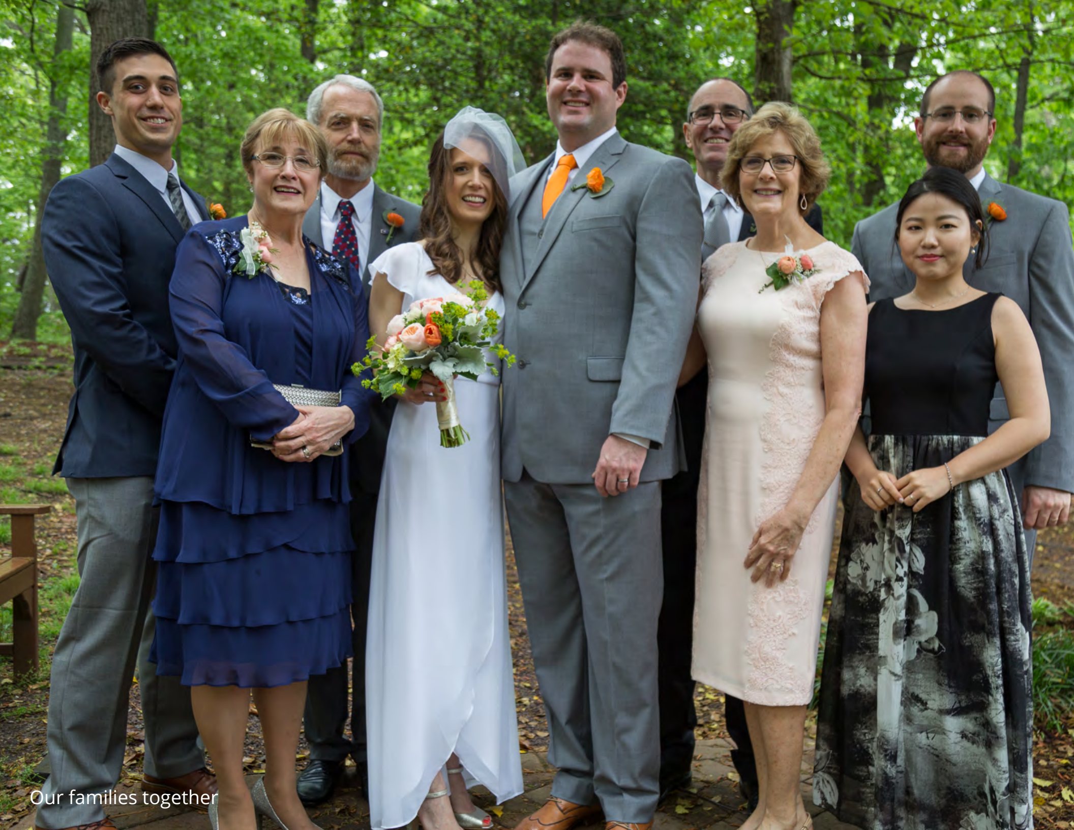
Our families together