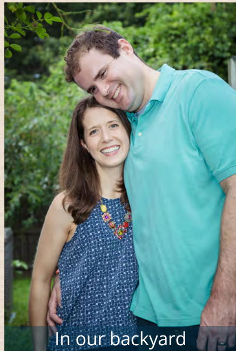
In our backyard