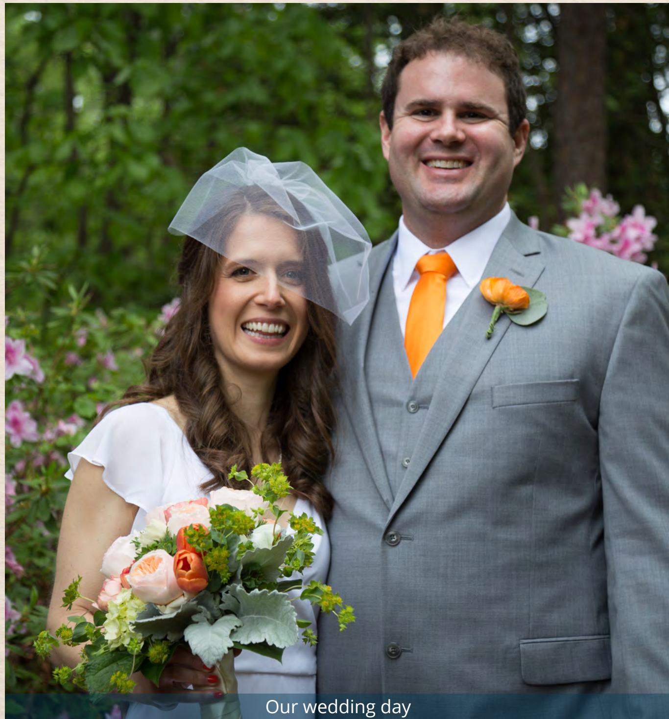
Our wedding day