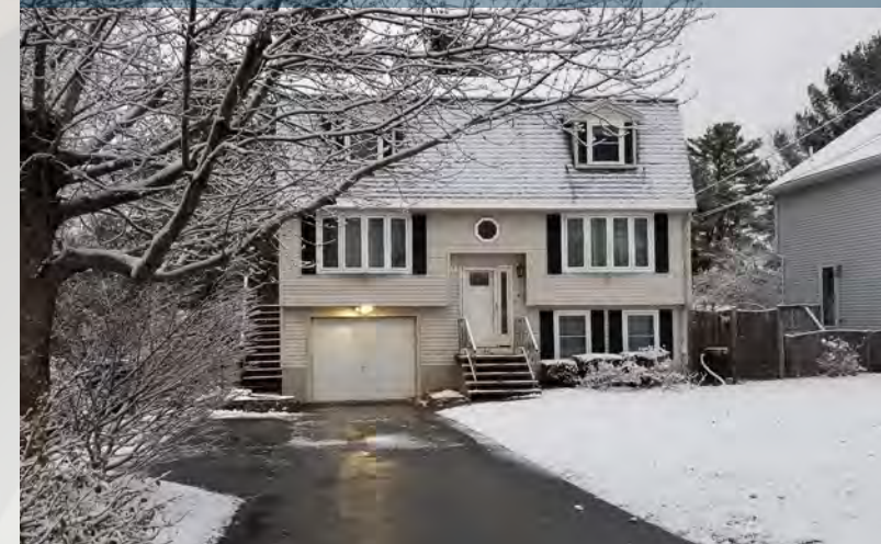
Our house in winter