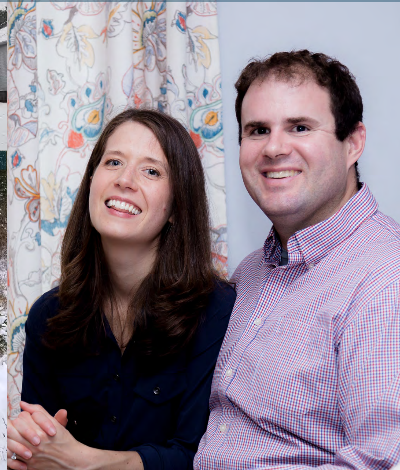
In our living room