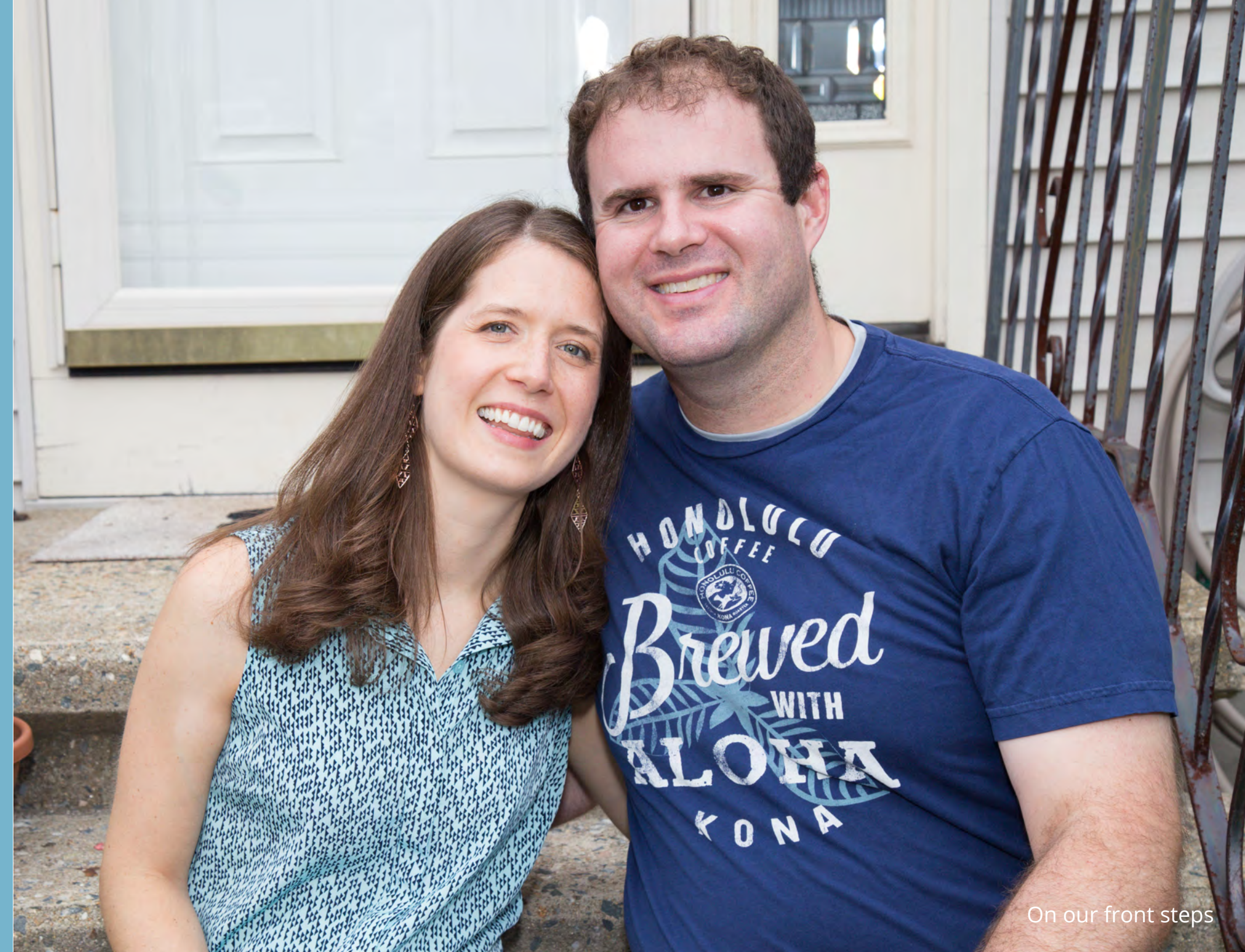
On our front steps