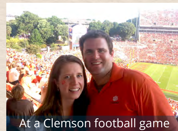
At a Clemson football game