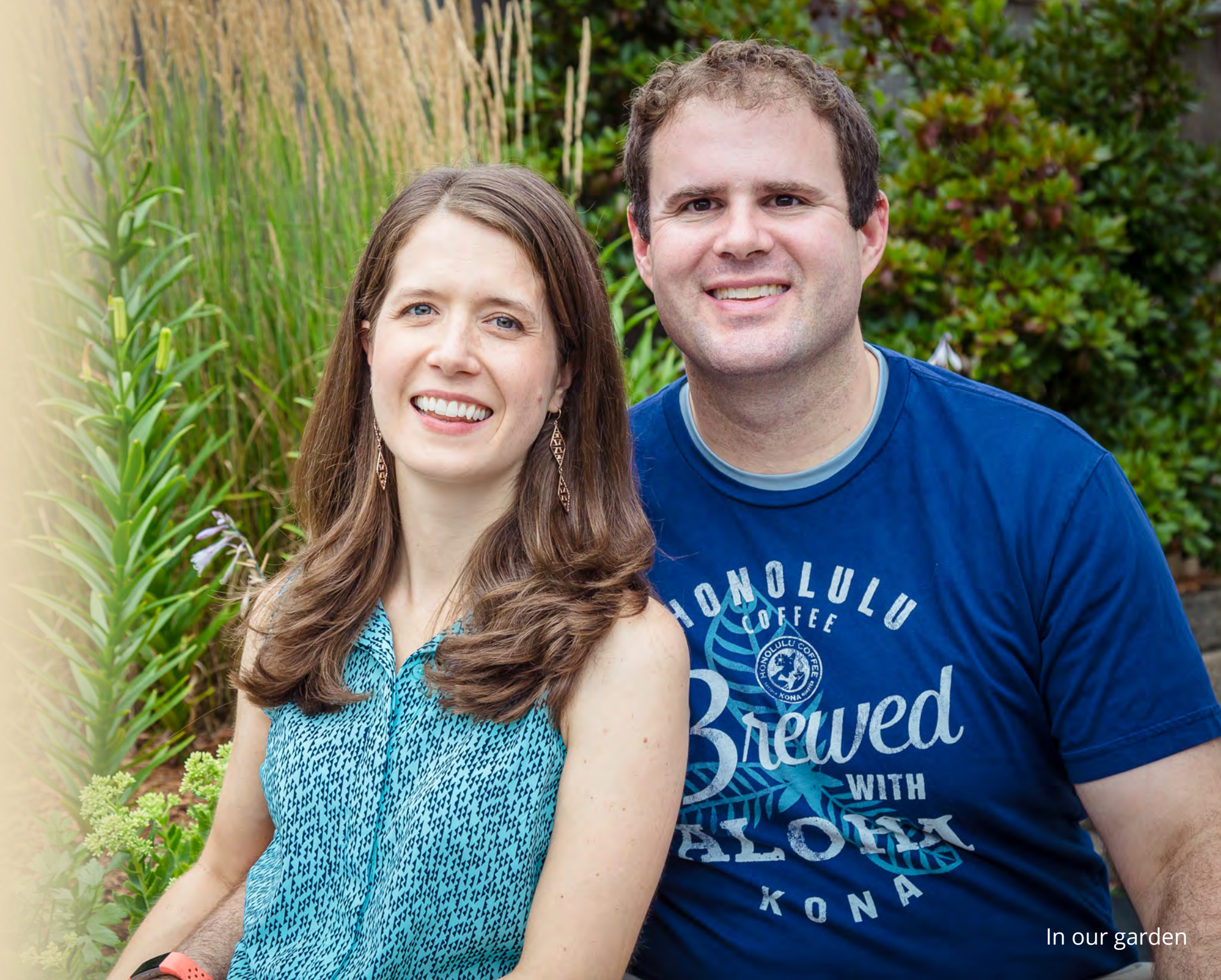
In our garden

In addition to knowing we will always be there for them, our future adoptive child will grow up knowing that they became part of our family through the beautiful process of adoption. We will also help them understand that our decision to adopt and your decision to place them for adoption, should you select us as your child's adoptive parents, were made with love. We are committed to maintaining contact with you to whatever extent you feel comfortable. We also want you to know that, on an everyday basis, we will emphasize your importance in helping us create our family. Thank you for giving us the chance to share our story with you.