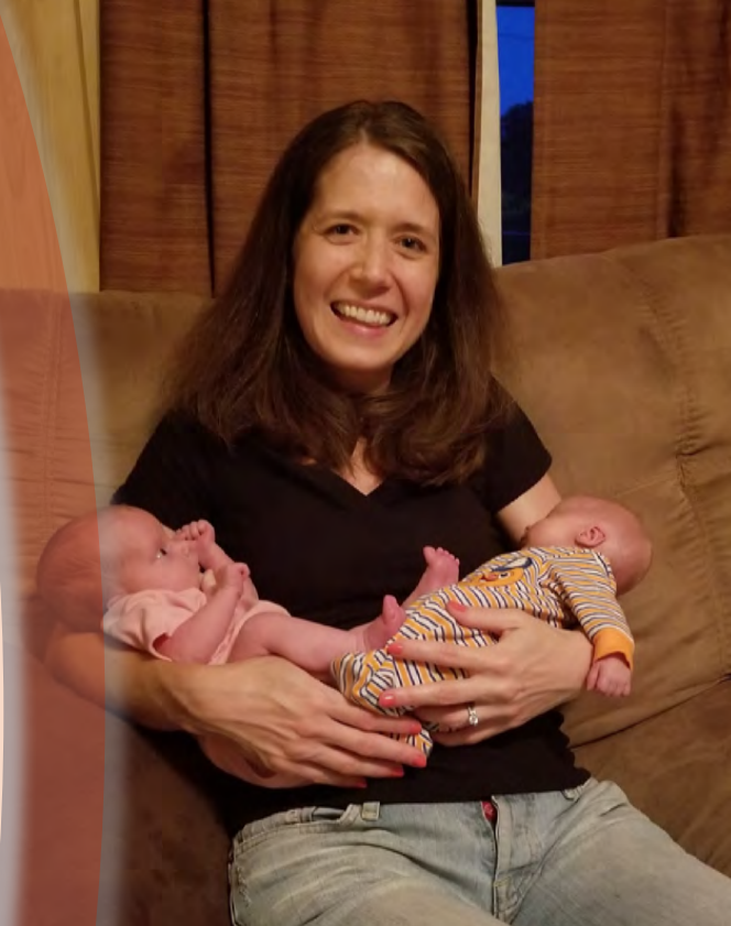
Meeting a friend's twins for the first time