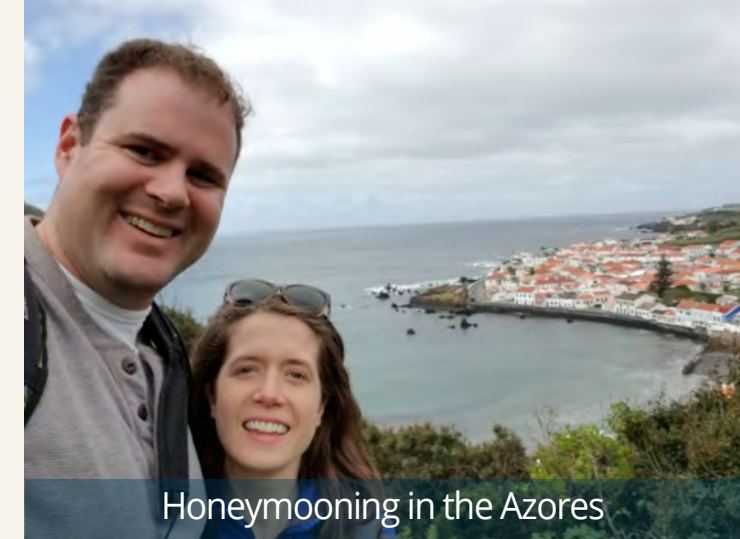
Honeymooning in the Azores

We aren't planning any more big trips in the short-term, so that we can focus our time and financial resources on starting our family. When the time is right, though, we are excited to introduce our child to our love of travel and to the different cultures of the world.