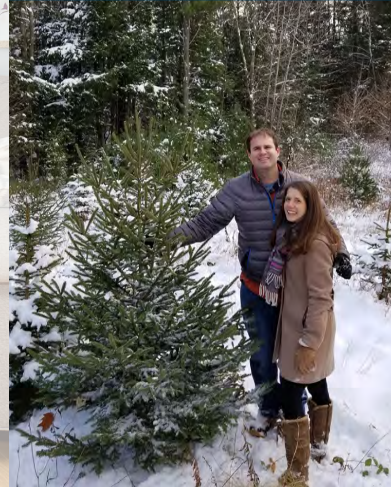
Cutting our Christmas tree