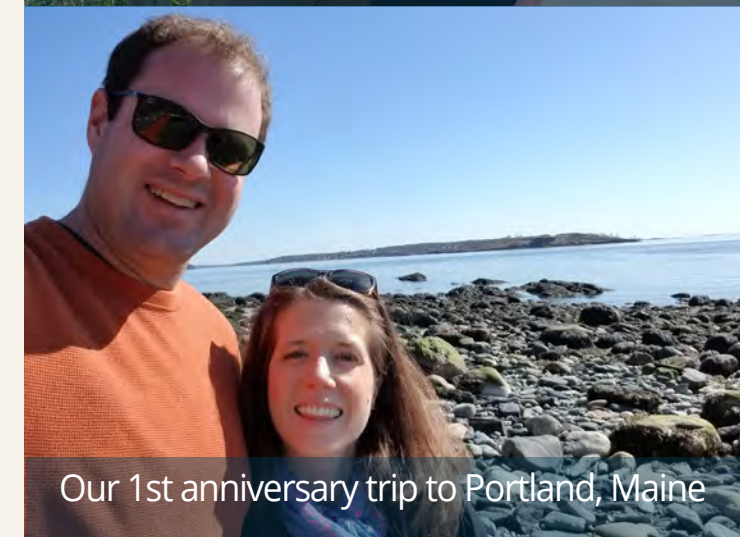
Our 1st anniversary trip to Portland, Maine