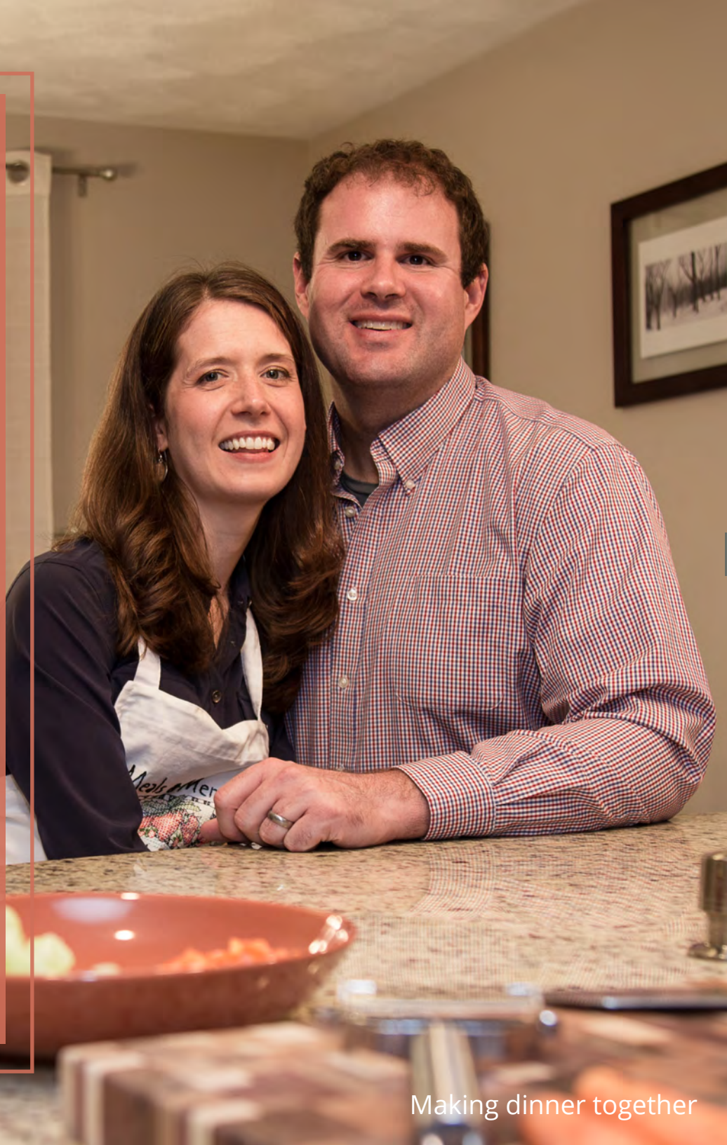
Making dinner together

While we enjoy our careers, we place a higher value on keeping a work/life balance, so our future child will be our top priority. Our employers are very supportive of our decision to start a family through adoption and know that we will prioritize being parents when a child enters our lives.