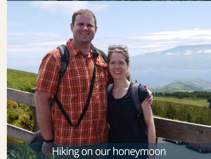
Hiking on our honeymoon