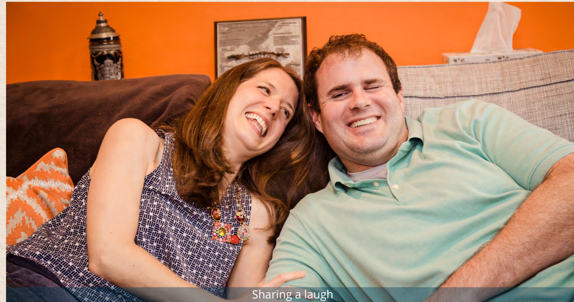
Sharing a laugh