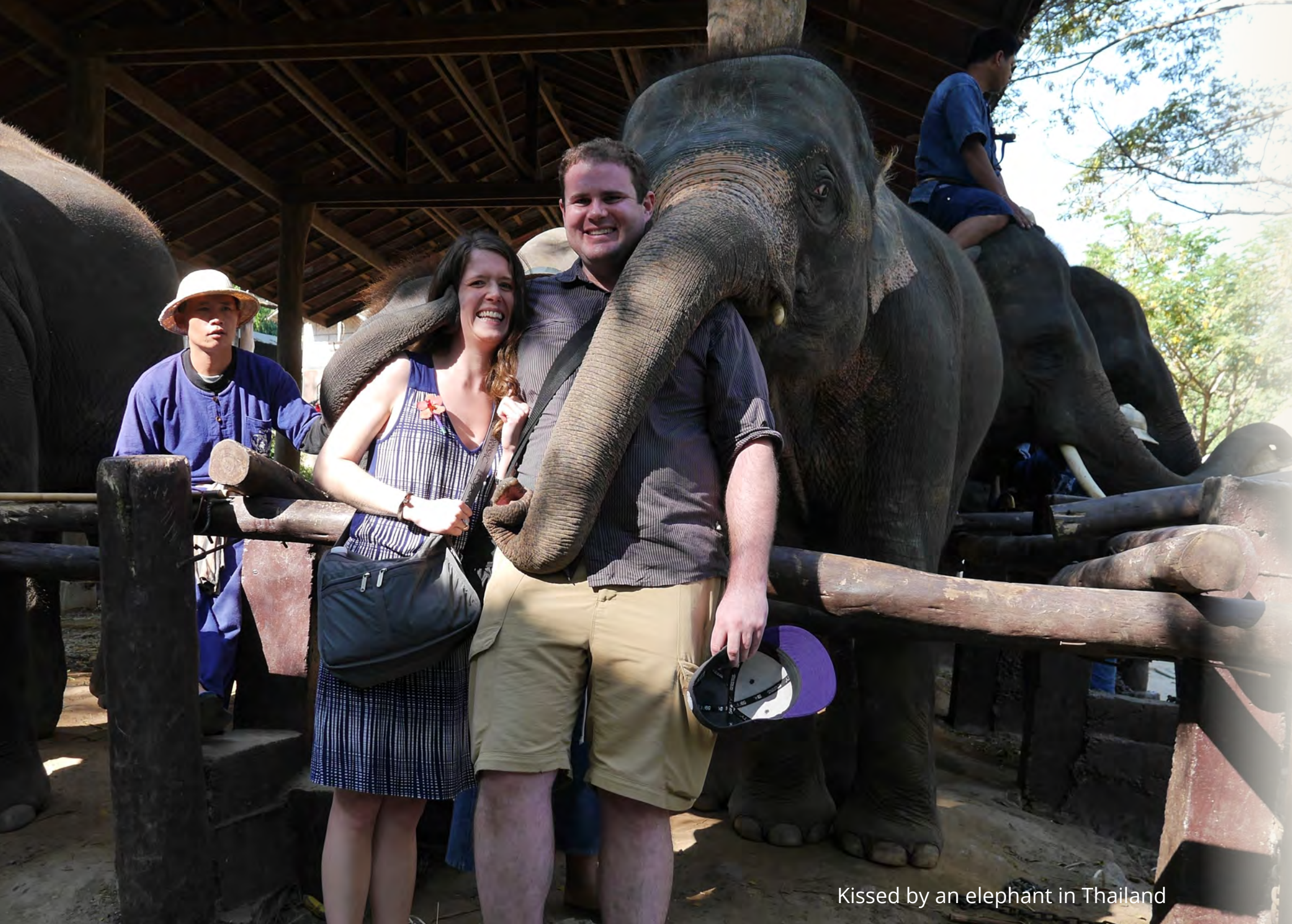
Kissed by an elephant in Thailand