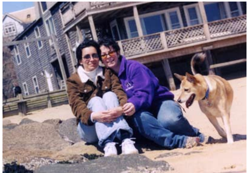
Time at the Beach