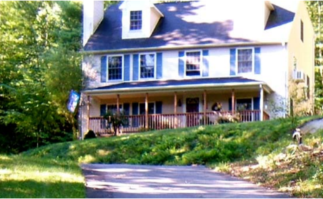
Our Home in Summer