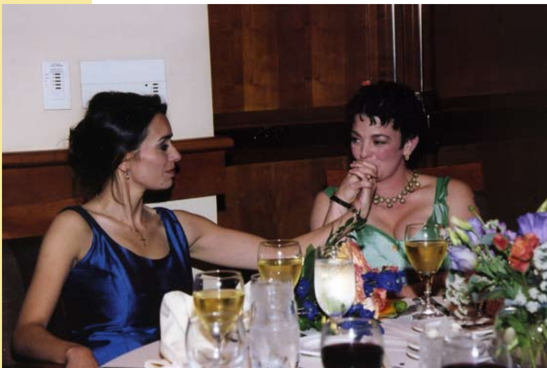
A Sweet Wedding Day Moment